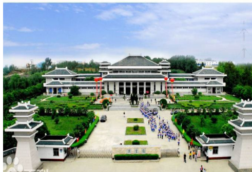
Fig.6 Nanyang Han Painting Gallery