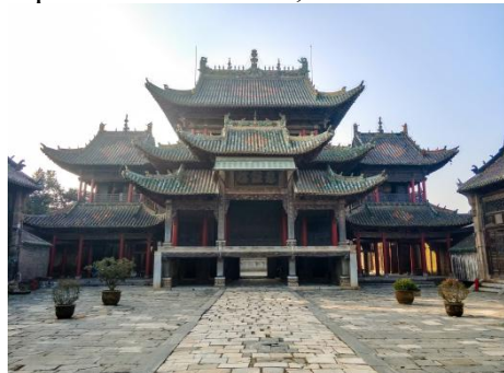
Fig. 1 Sheqishan Guild Hall

commercial culture, etc., All this embodies the traditional virtues of the Chinese nation, which are unyielding, impartial and selfless, and benevolence and love.(Fig.1, Fig.2)