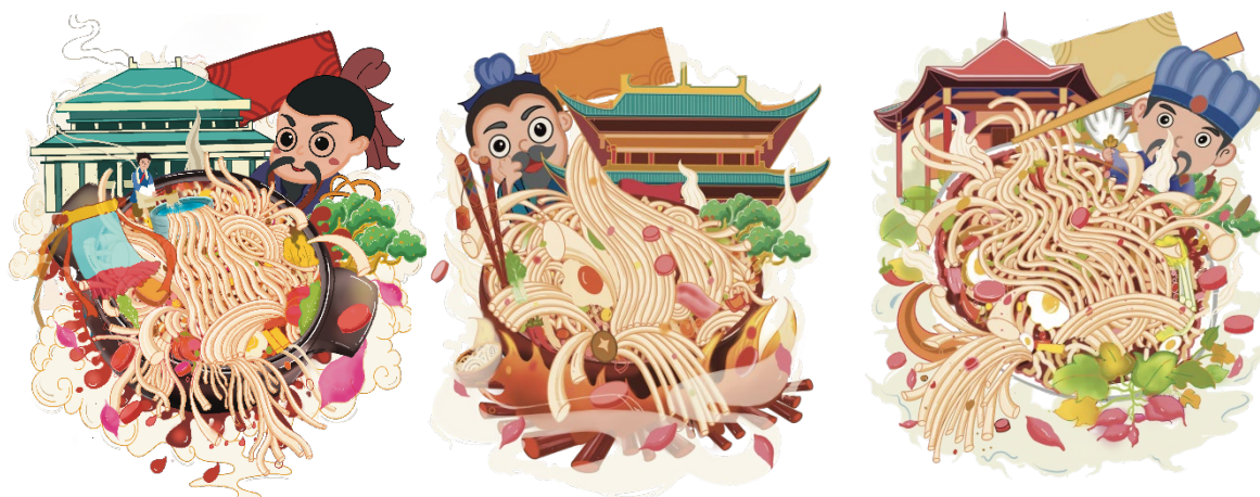
Fig. 7 Sheqi sweet potato vermicelli packaging color application