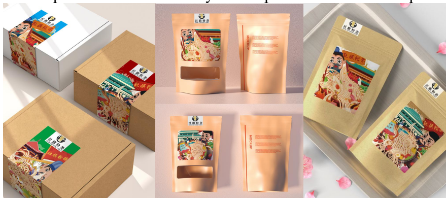
Fig.8 Sheqi sweet potato vermicelli series packaging display

Series packaging design is a contemporary of the more popular technique, series packing conforms to the general consumer's aesthetic psychology, diversified trend of development of the commodity packaging, can put the same brand, same type of products to design with common features, in the club banners sweet potato vermicelli packaging design innovation, adopt different characters and buildings, using the same symbol and subject to design the vermicelli, Form a series of packaging design, to achieve different visual image. (Fig.8) In this way, the effect of "one as ten" can be achieved, which can enhance the public's sense of identity for the product and further expand sales.