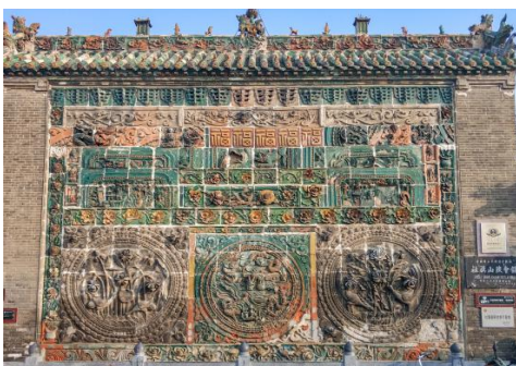
Fig. 5 Sheqi Shanshan Guild Hall

Not only play an important role in graphic design, color in packaging design is also the most direct, the most powerful elements of design expression, the packaging color design and application for a professional, colour is applied not only to the appropriate product content and reflects the local characteristics of regional culture, also need to have a clear recognition, and has been accepted goods buy class. In this way, consumers can take the initiative to buy products with a better appreciation. In the color application of sheqi vermilion packaging, the famous scenic spots such as Sheqi Shanshan Guild Hall, Nanyang Han Painting Museum and Wuhou Temple are taken as references to extract the main colors.(Fig.5, Fig.6) For example, in shanshan Guild Hall, colored glass wall, hanging mirror building, hall of Worship and other buildings, the main colors are cyan, yellow and gray, while in Han Painting hall, cyan and white are the main colors, so the architectural colors in design illustrations are mostly cyan, white and yellow. (Fig.7) This not only represents the color of local regional culture, but also improves product recognition and public recognition.