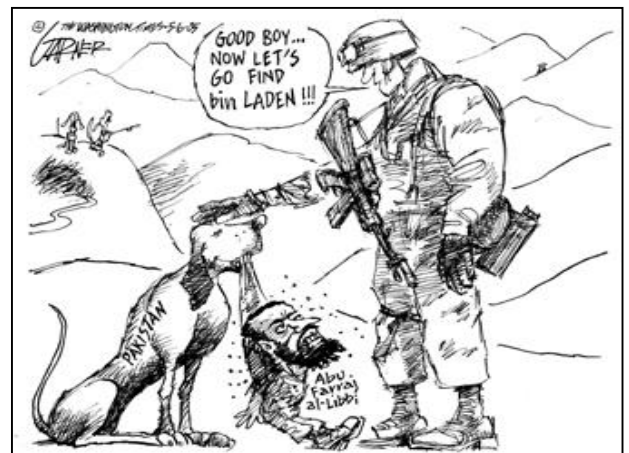
Figure 2. Political cartoon by Bill Garner in Washington Times (May 5, 2005). Adapted from “Dogged by a Cartoon” by BBC News, May 10, 2005.