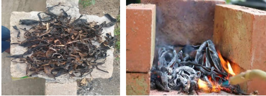
Figure-1 Open dried and powdered Banana peels

other ingredients like Dankote Ordinary Portland Cement (OPC) - Dankote Portland Limestone Cement Grade 42.5R from the nearby industries, Aggregates, and Potable water are collected. Sand considered for this study is a Pure River Sand. Quarry stones - Crushed Basaltic Rock (of size 20mm, clean, strong, and sharp, free of clay, loam, dirt, or organic matter) from Ken boat Ltd, Accra.