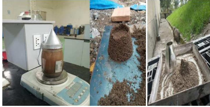
Figure-5 Test on specific gravity

Observed Specific gravity is found to be 2.60 (Closer to Minimum range). The specific gravity test results reveal that the fine aggregate is medium weight material. Hence it is OK.