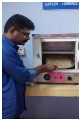
Figure-4 Test on Moisture content of sand

The moisture content of sand was tested (Figure-4) using oven at 105°C [8]. For concrete mixes, the moisture content of sand should ideally be around 2-6% by weight, to ensure proper water-cement ratio and concrete quality. Observed Moisture Content of Sand was 2.2%, hence it is satisfied.