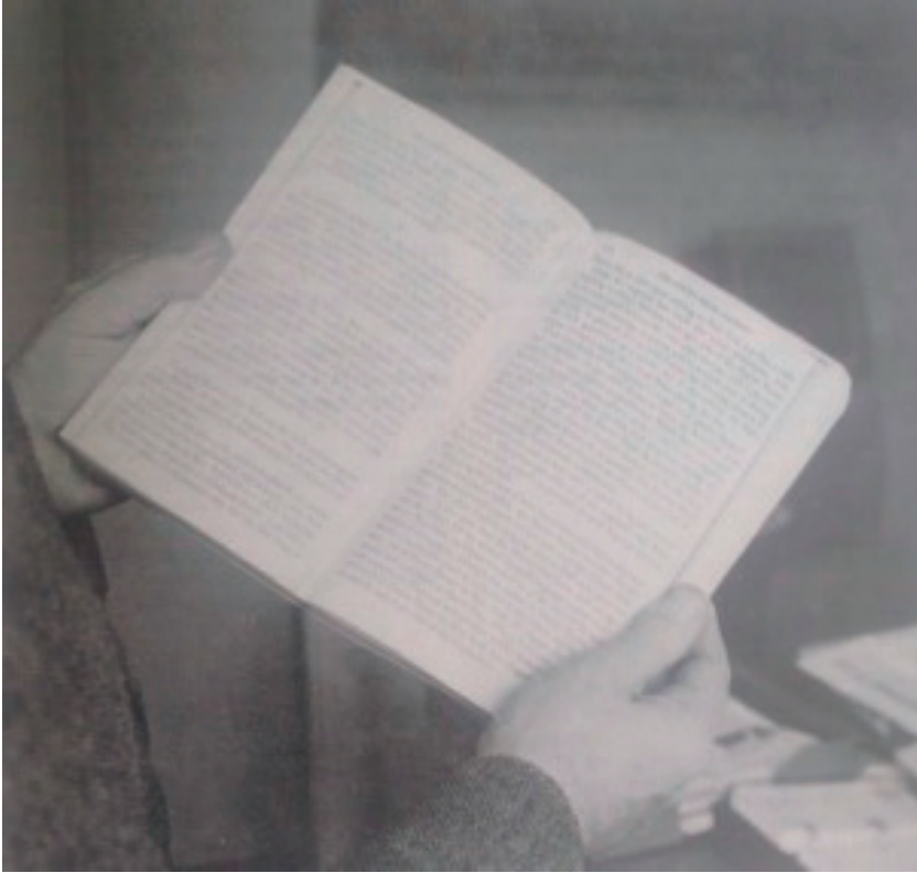
Figure 5. A single-copy edition of an out-of-print book, printed by Xerox from the Early English Books microfilm collection. From Power, “O-P Books, A Library Breakthrough” (1958).

to-find products into the hands of his customers. Power’s mistake, if I may call it that, was to misunderstand the gulf that separates the reading styles facilitated by microfilm from those that involve the more familiar (and more physically comfortable) act of handling bound paper. In this sense, Power makes exactly the same mistake that bibliographers like Pollard and Wing made when describing the Short-Title Catalogue as a finding aid. All seem to assume that the most important outcome of their work would be to facilitate reading in conventional ways. They hoped to put human-shaped protein bags in direct physical contact with book-shaped rag pulp.