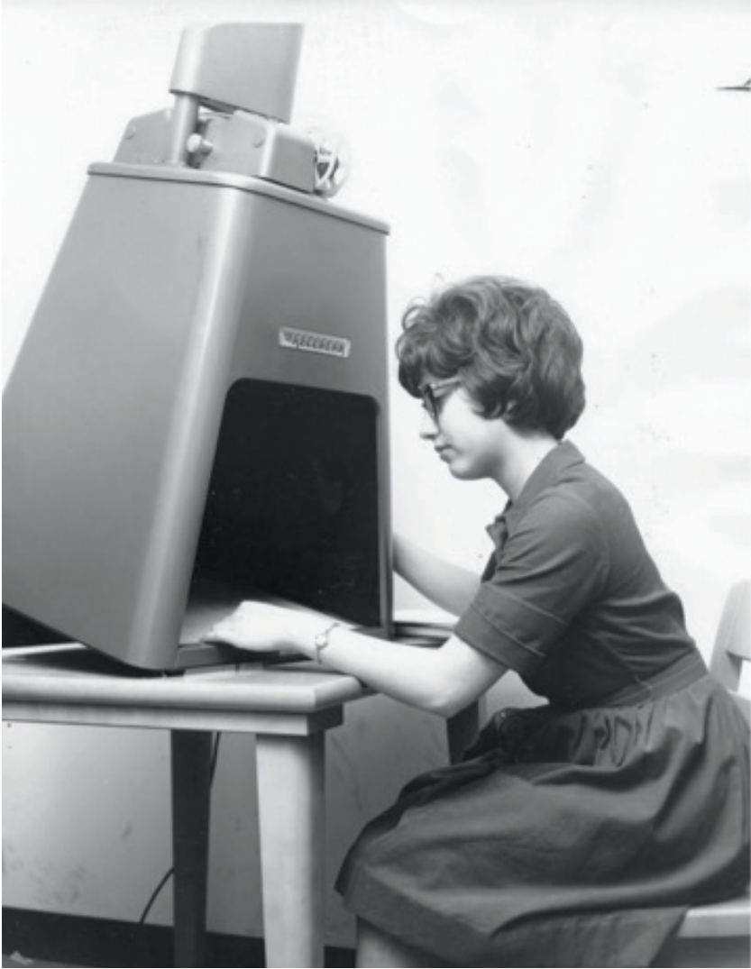
Figure 4. Recordak Microfilm Viewer, ca. mid-1960's.

1–17. Rider comes in for special ridicule by Nicholson Baker, who quips that his “enduring achievement was to convince the heads of research libraries that it was somehow embarrassing to add more low-cost storage space” ( The Double Fold ).