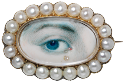
Georgian Eye Miniature, c. 1800 , http://www.vam.ac.uk/users/node/2136

On initial reflection, the subject of the gaze in the late eighteenth century seems completely removed from the traumatic metaphors unfolding in that sequence from Buñuel and Dalí's surrealist short Un chien andalou (1929), in which Simone Mareuil's eye is slit open with a razor—this after a thin cloud crosses the surface of the full moon. Hanneke Grootenboer's Treasuring the Gaze takes us into another territory—