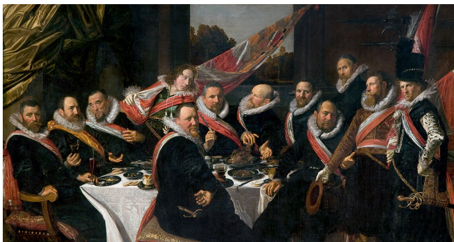
Franz Hals, Banquet of the Officers of the St. George Civic Guard (1616)

The pressure of high theory on the historical object is enormous. But where portraiture (however miniaturized) appears, there is a tradition out of which such a pressure rightfully emerges—and this is because we are dealing with portraiture. This tradition takes us from the nineteenth-century Vienna-School art historian Alois Riegl to recent thinkers such as the literary critic Harry Berger whose works have developed the premise of dramatic fictions in Dutch group portraiture.