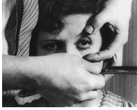
Un chien andalou (still) users.design.ucla.edu 1

On initial reflection, the subject of the gaze in the late eighteenth century seems completely removed from the traumatic metaphors unfolding in that sequence from Buñuel and Dalí's surrealist short Un chien andalou (1929), in which Simone Mareuil's eye is slit open with a razor—this after a thin cloud crosses the surface of the full moon. Hanneke Grootenboer's Treasuring the Gaze takes us into another territory—