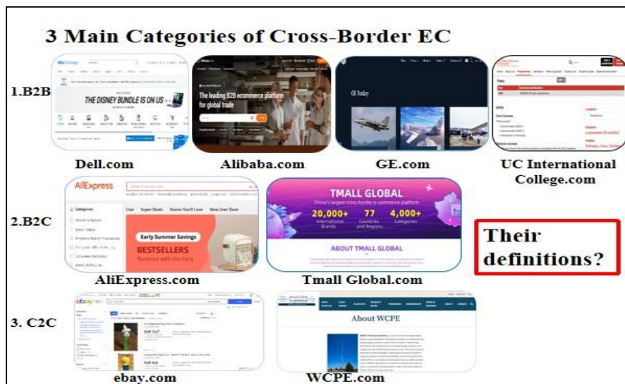
Figure 4: Teaching Slide 2: Teaching 3 Main Categories of CBEC

Firstly, after students have some initial understanding of the above 8 companies, they are encouraged to work in pairs to classify them into 3 main categories and then the teacher can ask them to fill the definitions of these three main categories in the right column of Table 2 according to the textbook. The interactive teaching of 3 main categories of CBEC is shown in Figure 4.