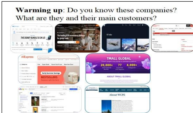
Figure 2: Teaching Slide 1: Warming up

At the beginning of the class, to arouse students' interest, thinking, and interaction, the teacher can start by simply showing students several authentic pictures of home pages of CBEC companies and ask them what companies they are and what major customers they have. These 8 home pages are from Dell.com, Alibaba.com, GE.com, UC International College.com, AliExpress.com, Tmall Global.com, ebay.com, and WCPE.com. Each of them represents one kind of CBEC. The teaching step of warming is shown in Figure 2.