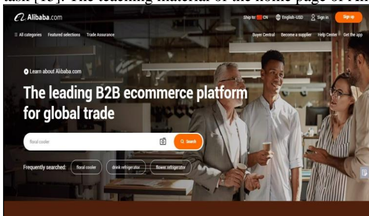
Figure 3: The Teaching Material of the Home Page of Alibaba Step 2: Constructing financial knowledge.

To give students a clearer view of these home pages, the teacher can show students these pictures separately. For example, from the authentic picture of the home page of Alibaba, students can see clearly “the leading B2B e-commerce platform for global trade” and “become a supplier” and interact with the teacher that main customers of Alibaba.com are businesses. This is the effect of authentic teaching material. It can help students engage themselves in classroom interaction. Authenticity of language use relates to the response of the language user. It is thus a factor of the activity or task the user-learner undertakes, and of his/her perception and conviction of the task [15]. The teaching material of the home page of Alibaba.com is shown in Figure 3.