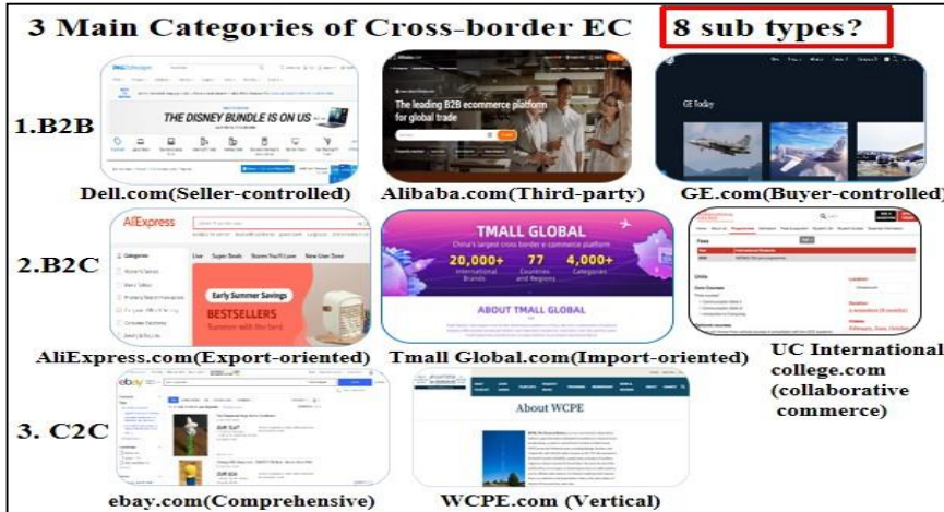
Figure 5: Teaching Slide 3: Teaching 8 Sub-types of CBEC

sub-types. The interaction between the teacher and students on this part can be shown in Figure 5.