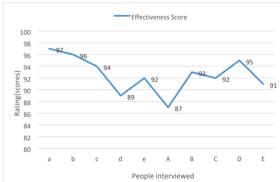
Figure 2: Questionnaire survey results on Sino African educational exchange and cooperation projects

Sino African education exchange and cooperation projects are shown in Figure 2: