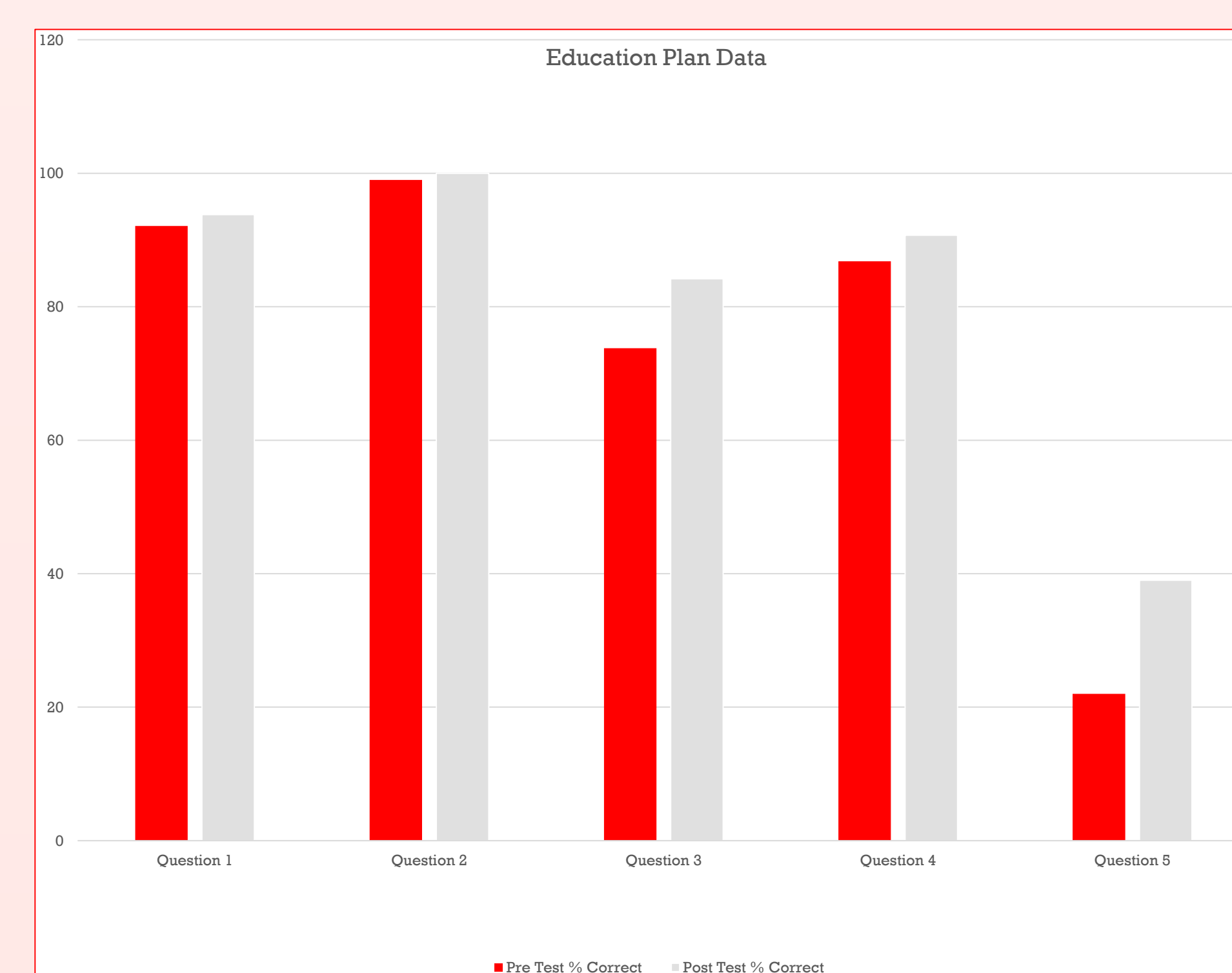
Graph created presenting results of pre and post test questions and correct response rate