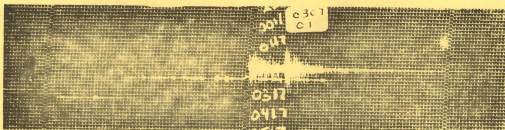
The microearthquake pictured here occurred outside of the array in area 25-30km northwest of the Loon Lake station.