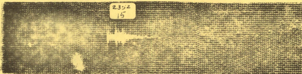
This seismogram depicts a microearthquake occurring near the Glade Creek station at the northern end of the array.