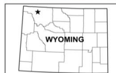
Figure 3. Locations of Four Sentinel GLORIA Peak in Yellowstone National Park.

Map by Bernadette Kuhn, Colorado Natural Heritage Program, 2012.