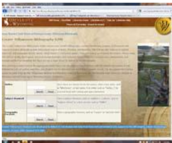
Figure 5. University of Wyoming's “Greater Yellowstone Bibliography” search interface page. Accessible via UW Libraries - www-lib.uwyo.edu - under Research Tools => Articles and Databases. Text at bottom has been highlighted for easier reading. Accessed September 2011.

The University of Wyoming Libraries maintains the Greater Yellowstone Bibliography (GYB) (VanArsdale and Hert, 2000). The GYB is an electronic resource accessible via the UW Libraries' website. According to the website, the GYB includes “over 28,900 bibliographic citations to scholarly, popular, professional, and creative literature about the greater Yellowstone region...” (Figure 5).