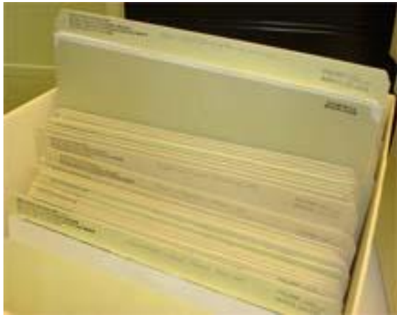
Figure 2. File folders from Box Number 2 in Catalog Number GRTE 55552. Pulled up is Series 001.003, Folder 001, titled “Master Lists of Collecting Permits, 1997-2001”.

In the proposal for this internship, the majority of the time was projected to be spent contacting researchers whose permits lack follow-up documentation, and/or check repositories that house their research materials to record what specimens they had taken and scholarly works written. However, as the work progressed, it became clear that it would not make sense to start contacting people until the various information sources were documented.