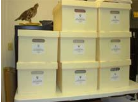
Figure 1. Catalog Number GRTE 55552. The permit records that are the focus of the first category of projects are primarily within these eight records boxes. This is in the Archive Room at the Colter Bay.

some cases, they may not even have been submitted. Since the Park formalized its Archives program, in 2006, these problems are more avoidable because the organization of such important information now has specific professional oversight.