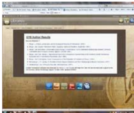
Figure 6. GYB search result list for Author search on: “Berger, J.”

resource. Some attempts to cross-reference author search results in GYB with permits or other research in the Finding Aid yielded possible matches. As an example, Figure 6 shows the results from a GYB author search for “Berger, J.” That search returned seven results, of which, two were possible matches to permits listed in the Finding Aid .