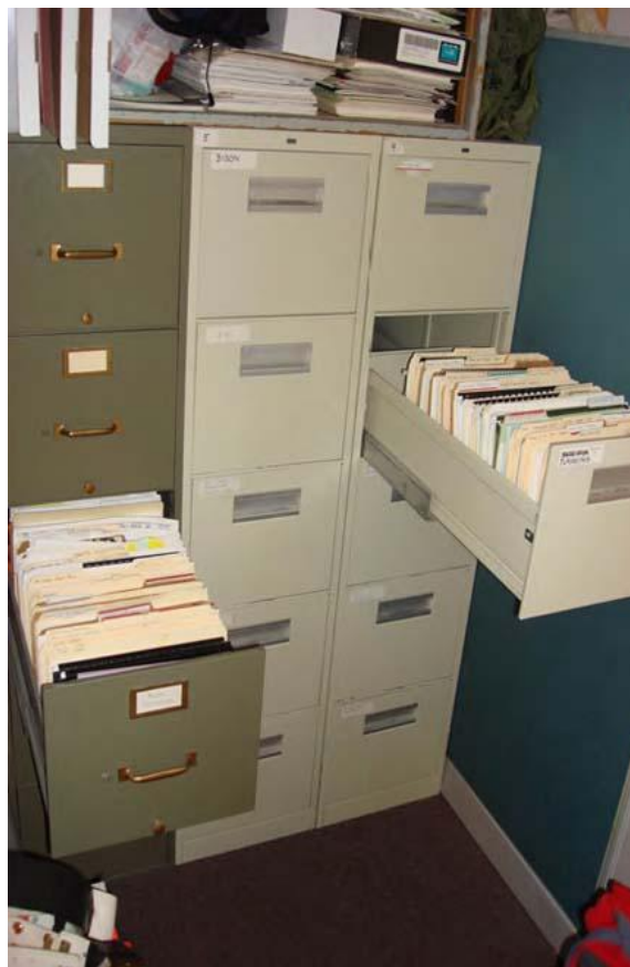
Figure 8. GRTE Biological Science Program Files. These are the cabinets where Senior Biologist Steve Cain kept the files. Science and Resource Management building, temporary GRTE headquarters complex, Moose, Wyoming.

The material mostly contained files on various animals in the Park, with major entries for Bison, Elk, Grizzly Bear, and Wolves. For each file cabinet drawer, an Excel spreadsheet file was created, with a concise descriptive line of data for each folder. Contrary to modern spreadsheet data entry conventions, which call for separate columns for each data category, a single field was used for several categories of descriptive data: Transcribed Folder Label; Subject; Format; and Inclusive Date(s) (Figures 9 and 10). This was necessary to maintain consistency in formatting with prior preliminary inventories.