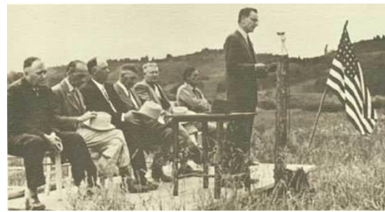
Figure 1. Laurance Rockefeller speaks at the opening ceremony.

would promote equality and the local economy through affording greater access to wildlife for all visitors, while also bringing in tourist dollars. In short, Laurance presented a JHWP which offered universal benefits for nature – human and non-human. 1