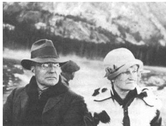
Figure 2. John D. Rockefeller Jr. and his wife Abby at Jenny Lake, 1931. Reprinted, by permission, from Grand Teton National Park: Jackson Hole Wildlife Park, Historic Records Collection”