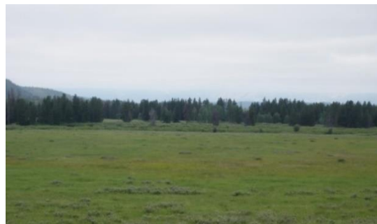
Figure 5. View of the meadow where the Wildlife Park once existed. Photo was taken from the spot where visitors sat in 1948 to hear Laurance Rockefeller speak at the opening ceremony.

education, and the viewing of wildlife have not always operated in harmony. Nonetheless, managing the tension between them remains central to the daily operation of national parks. It is no less true today than on that fateful day in 1948 when Laurance Rockefeller opened the Wildlife Park.