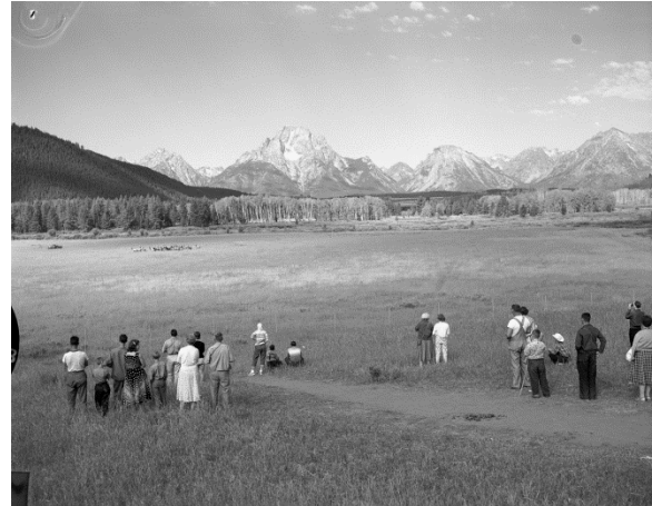
Figure 4. Tourists visit the Wildlife Park.