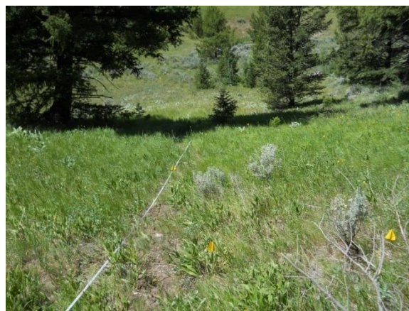
Figure 2. Photograph of a transect for distance sampling. The white line is the transect line and yellow flags indicate the location of observed L. idas butterflies.

We estimated population densities (adult butterflies per square kilometer) using the distsamp function in the unmarked R package. We binned the