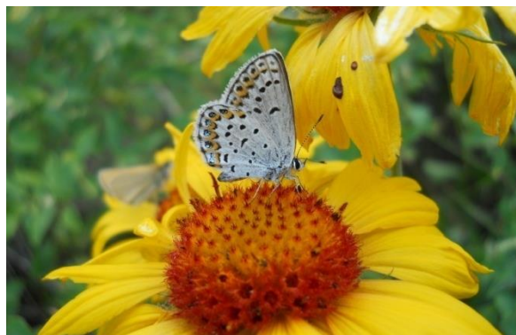
Figure 1. Photograph of a L. idas butterfly perched on an Aster.

and strength of environment-dependent selection varies among populations and over generations and that this variation is sufficiently large to contribute to the maintenance of genetic variation in L. idas . This report documents the results from the first year of this study (2012), during which time we began collecting L. idas for DNA sequencing and conducted a pilot project to quantify population sizes (population size is an important parameter for our evolutionary models).