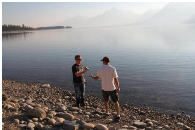
Students enjoy some time exploring. (Barbosa, 2012).