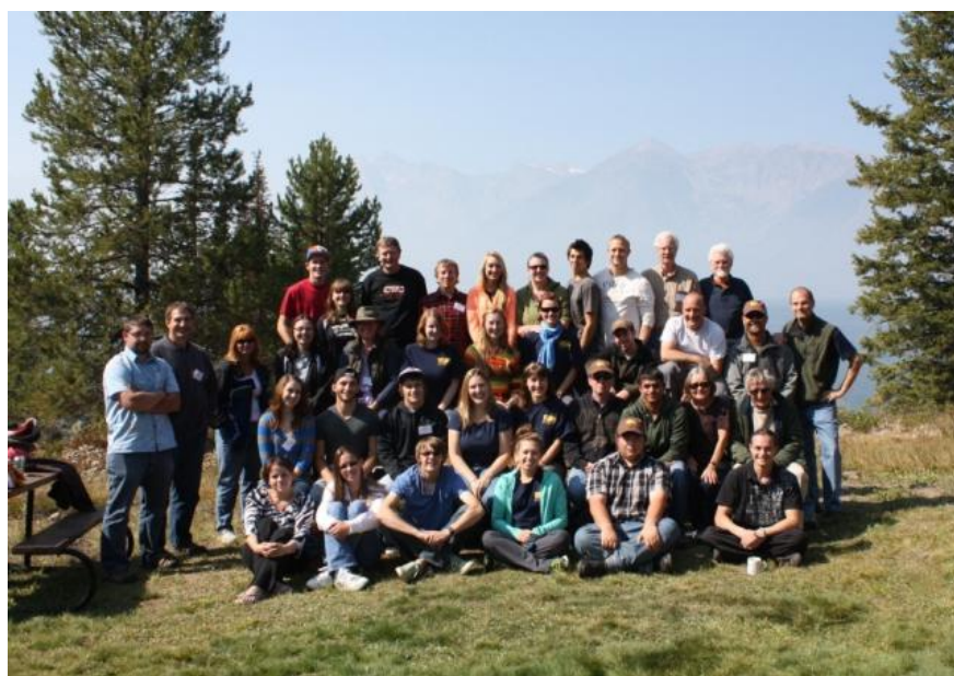
Students and Faculty from across the state.