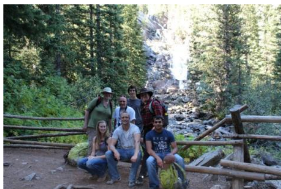
Students and faculty out on a hike. (LCCC, 2012).

This project was supported by grants from the National Center for Research Resources (5P20RR016474-12) and the National Institute of General Medical Sciences (8 P20 GM103432-12) from the National Institutes of Health.