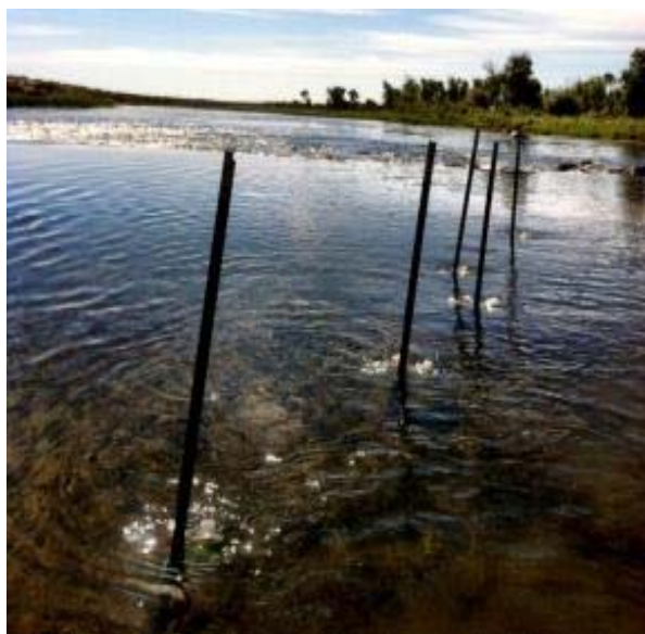
Figure 1. An example of a pelagic nutrient uptake incubation experiment performed in the Green River at Seedskaadee National Wildlife Refuge.

We collected water chemistry samples throughout all incubations by removing 60 mL of water from the chamber, filtering 20 mL of the sample through a 0.2 \mu\text{m} SUPOR filter (Pall Corporation, Port Washington, NY, USA) into a sterile 50 mL centrifuge tube (VWR, Radnor, PA, USA) as a rinse. After rinsing, we filtered the remaining 40 mL of sample into the tube and stored samples on ice until return to the laboratory, where we stored samples frozen until analysis. We quantified dissolved \text{NH}_4^+ using the phenol-hypochlorite method (Solorzano 1969), \text{NO}_3^- using the cadmium reduction method (APHA 1995), and P using the ascorbic acid method (Murphy and Riley 1962) on a Lachat Flow Injection Autoanalyzer (Lachat Instruments, Loveland, CO, USA). To quantify nutrient uptake, we calculated the first order decay rate of nutrients over time ( k ; \text{h}^{-1} ) and then converted this decay rate to volumetric uptake ( U ; \text{mg m}^{-3} \text{h}^{-1} ) by multiplying by background concentration.