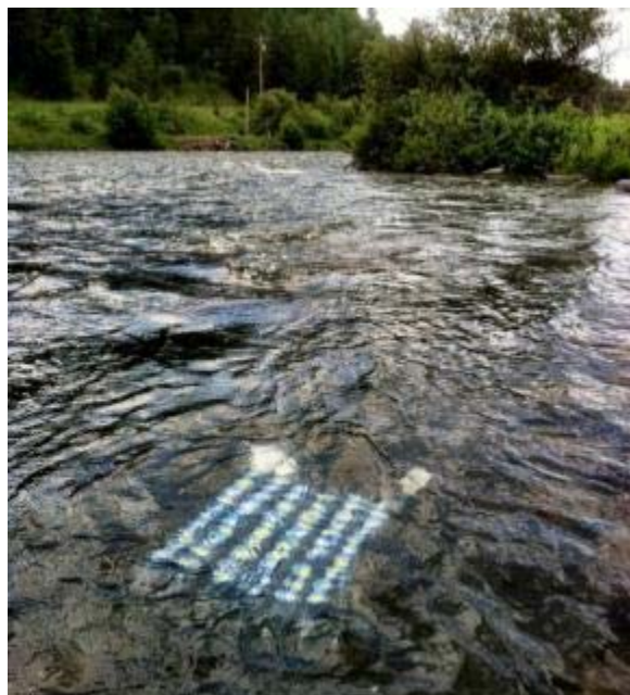
Figure 2. Nutrient diffusing substrata were deployed in five rivers throughout the GYA.

To quantify the nutrient limitation status of autotrophic and heterotrophic biofilm productivity, we ran two-way analysis of variance (ANOVA) on GPP and R of both inorganic and organic disks using the metabolic rate as the response variable and the presence of N and/or P in the NDS as the factors (Tank and Dodds 2003). As we had two different forms of N