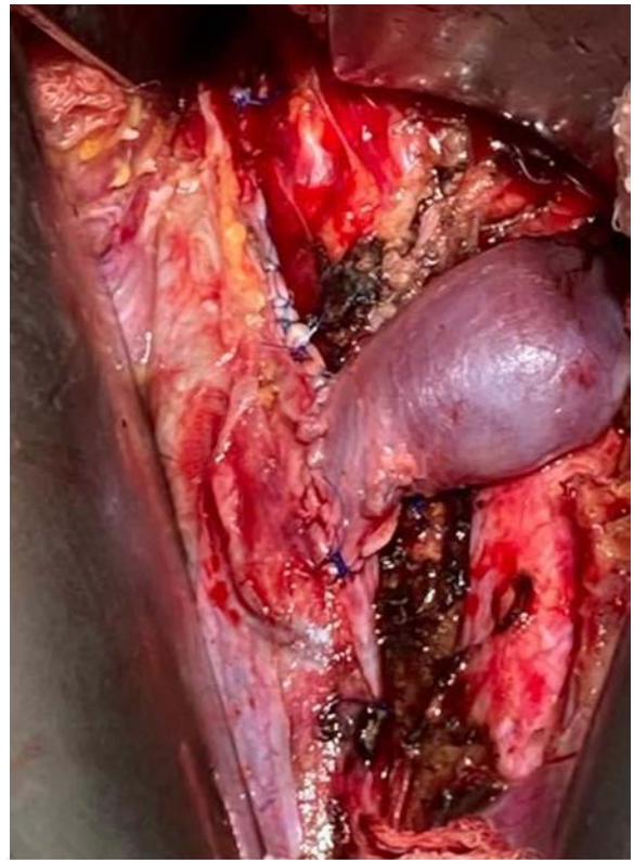
Figure 3. Intraoperative photograph showing the completed renal transposition.

The management of NCS remains a challenging clinical scenario, and the selection of an appropriate therapeutic approach necessitates careful consideration of the patient's clinical presentation and the severity of the syndrome. Several treatment options are available, including conservative management, endovascular interventions, and surgical correction. Conservative management is usually proposed in mild cases or when the symptoms are manageable by pain control and close monitoring, 6,7 especially in the