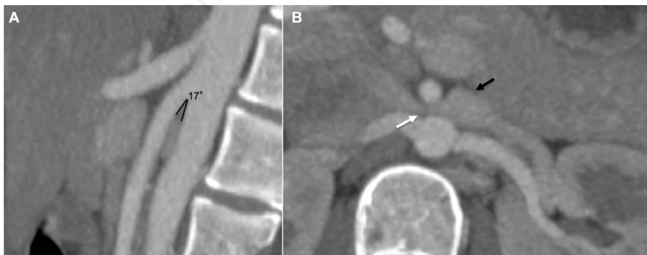
Figure 1. Preoperative computed tomographic angiography showing A ) the small aorto-mesenteric angle ( 17^\circ ) between Superior Mesenteric Artery (SMA) and abdominal aorta B ) that compress the left renal vein (white arrow) with a consequent pre-stenotic dilatation (black arrow).

Postoperative follow-up appointments were scheduled at the outpatient clinic at 1, 3, 6, and 12 months after surgery, followed by annual visits thereafter. Ultrasounds were conducted during each visit, with a CT scan scheduled at the 3-month mark for comprehensive evaluation.