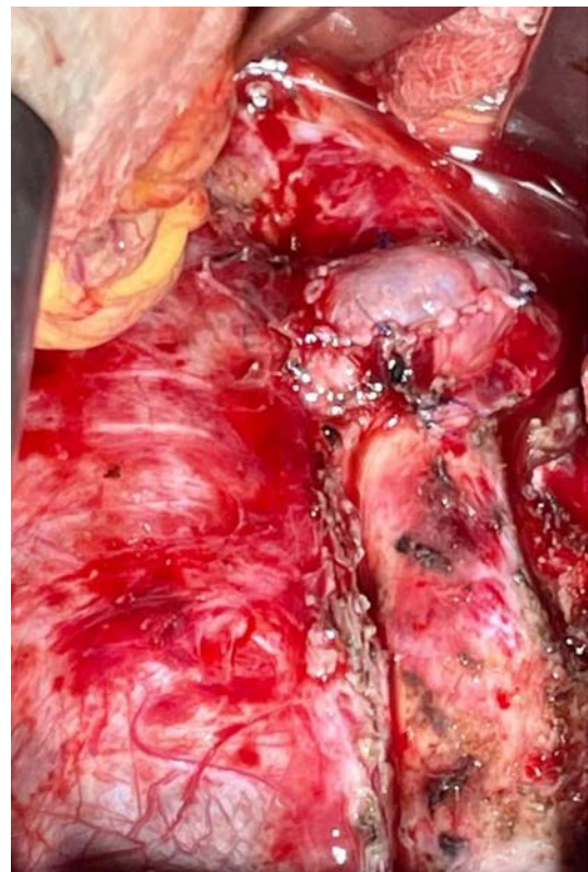
Figure 4. Intraoperative photograph of the completed procedure comprising saphenous vein patch venoplasty.