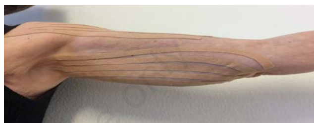
Figure 2. Picture of the application of the Onorato-Ausberghe method on one of the patients with symptoms in the axillary and brachial area.

Our observation has led to promising results, both from the anatomical/physiological and subjective/functional point of view, while reducing spontaneous recovery time and in the absence of significant symptoms left at T1. These results suggest the necessity to expand the group of patients, in order to obtain data that can be used for statistical scopes.