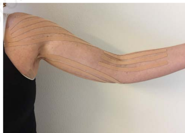
Figure 3. Image of another patient with symptoms in the axillar, brachial and cubital area.