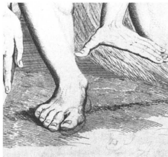
Figure 4. Detail of page 99, The Four Zoas .

In physically turning page 99 to read the verso side, page 100, the reader participates in the process of bodily thought that breaks redundancy of identity. By a flip of the wrist and a turn of the page, the reader becomes the agent of change. Moving from page 99 to page 100 the figure shifts between FatherTime and a half man, half animal form. Notice that it is not only the eye that reads but also the hand and the wrist. Blake makes us aware of reading as a bodily process in which readers give over their whole bodies to the process of reading. There is no