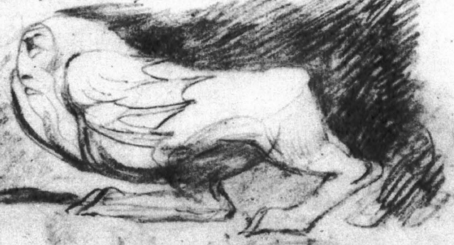
Figure 3. Page 100, The Four Zoas. Night VIII. Pencil and chalk drawing with chalk shading.

But Wagon his mighty rage let loose in the mid sleep Speeches of den affliction and from round his frozen limbs Mouths holes & rats he found leaving the words of iron The drops & million millets cast in yellow glory & word Tubes in petrified steel & round unbroken shells & wheels And chains & pulleys fabricated all round the corners of my Commencing with the trumpet of joy in dark determination And with the organ of Satan in each substance To determine the words of joy & less bright Methusalem