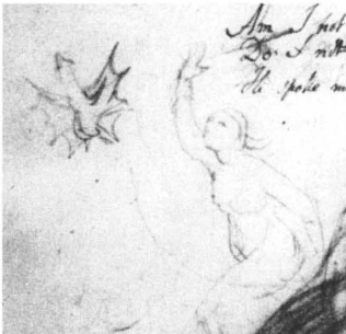
Figure 6. Detail from page 42. Night III. Pencil and chalk drawing.

The drawing on page 100 has bat wings. Since more than analogy is at work, wings of Time from page 99 do not simply translate into bat wings. The bat wings replace arms and feathered wings. What guides transformation in becoming is not similarity but rather a constellation of vector forces applied to an object. The war forces have been evident since Night One. Likewise, weighing animal against man begins in Night One. In dire misery, Enion laments that "The Horse is of more value than the Man. The Tyger fierce/ Laughs at the Human form. The Lion mocks & thirsts for blood" (15:1-2). And also, sexual division has played its role in the narrative of the "torments of love and jealousy," as the poem is subtitled. The phallus combines with the troops of war and the animals to express at various levels the conflicts of the narrative.