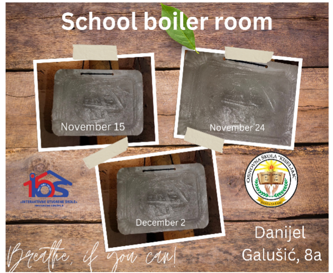
Figure 3: Poster authored by Danijel Galušić, a student in the author's class of an air pollution catcher in school boiler room

I also introduced a practical demonstration of temperature inversion, a natural phenomenon common during the city's winters. Under normal conditions, temperature decreases with an increase in altitude; however, under certain conditions, the situation becomes reversed and the temperature starts increasing with altitude rather than decreasing. As the cold air stays down (blue water in our experiment), and warm air goes up (red water), it creates "a trap" for air pollutants (invisible layer between the two colors) (see Image 2) near the ground and prevents the dispersal of smog. This experiment demonstrated to students that it is not just the human factor causing or contributing to air pollution. Additionally, it helped us learn or practice vocabulary concerning everyday household items (jar, tube, funnel, wood skewer, and kettle) and cooking-related verbs (pour, stir, and boil).