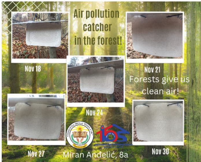
Figure 2: Poster authored by Miran Anđelić, a student in the author's class of air pollution catchers in the forest

gave different hypotheses such as I expect the catcher above my front door to remain pretty clean in two weeks period, I assume the catcher in school boiler room will be very dirty in a short period of time, and If I put my catcher in the forest, it will stay clean during the observation period. At the end of the two-week period, students presented the findings. The class's hypothesis that the air we breathe is very dirty was proven true. The contrast in results between the clean (forest) and dirty (school boiler room) test environment was striking (see Figures 2 and 3). Although PM 2.5 particles cannot be seen by the naked eye, the changes on the school boiler room catcher were quite visible.