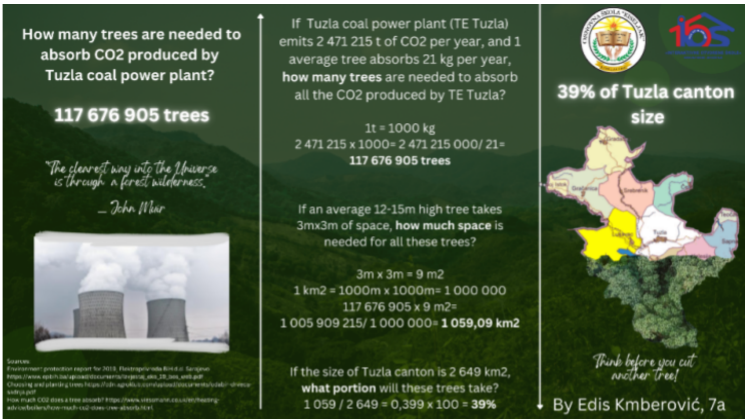
Figure : Poster authored by Edis Kamberović, a student in the author’s class which includes calculations of the number of trees needed to absorb CO 2 produced by the power plant Tuzla

naming different parts of their models in English (solar panels, wind turbines and blades, transformers, generators, etc.).