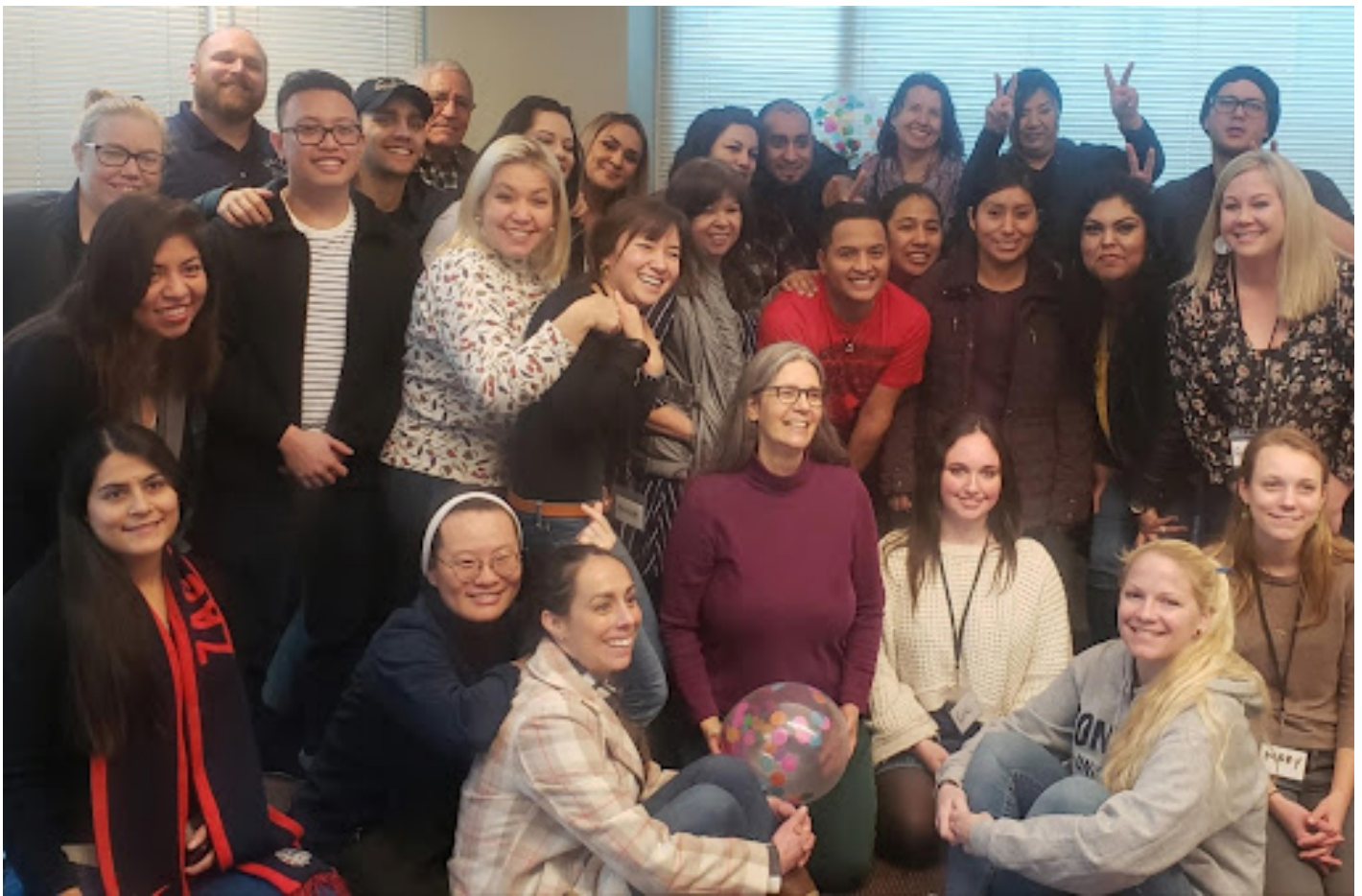
GECO students, teachers, mentors, volunteers and coordinators

but learners and community builders themselves throughout the mentorship experience. For those who are not active teacher-trainers, the feedback and observation process allows them to pause and reflect on their own teaching philosophies, strategies, and tendencies. For those who are not consistently engaged with the off-campus (and with Zoom, the global) community that GECO brings together, the GECO classroom fosters (re)connection with the educational contexts and social justice needs beyond the campus bubble. And for those who are open to learning from the “less experienced,” a new technology or method will surely emerge that they can then incorporate into their own teaching.