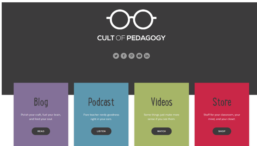
Figure 1: Cult of Pedagogy Homepage

Due to the pandemic and an entire year of teaching online, I craved offline activities but still wanted to be engaged as a teacher. This craving pulled me toward the Cult of Pedagogy's podcast section. Currently, there are 181 different episodes, and more are being added. In the mornings, usually after I finished teaching two long Zoom classes, I would venture outside to walk my dogs at a nearby park, playing a podcast or two as I enjoyed some fresh air. Feeling that I had missed out on previous years and needed to catch up, I devoured all I could. This podcast in my pocket was refreshing, revitalizing, and reconnected me to new ideas in teaching. No more screen time, please (see Figure 2).