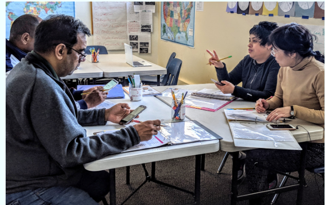
Students working with Google Translate

comparative structures or third person conjugation. In multilingual classes, create groups according to home language. Each student needs paper for the dictation. Explain that they should listen and write the sentence they hear in their OWN language. Once you have read the sentences and students have written their translations, have them work in their groups to compare and discuss what they wrote. Next, have them translate the sentences back into English. Again, have them discuss and compare their ideas with each other. Finally, give students the original sentences and have them check their work. Then analyze differences and highlight any language points that are relevant with the class.