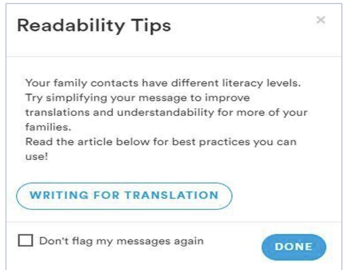
Figure 3: TalkingPoints readability evaluator with links to advice