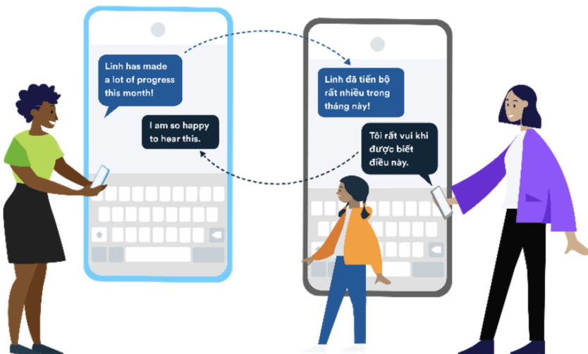
Figure 1: TalkingPoints translates between families and educators

The TalkingPoints teacher application is accessible via computer and mobile devices. Educators can create up to five classes for free. Once your classes are set up, the application allows for the creation of individual messages and whole class announcements. The platform allows users to attach photos, website links, and documents. Messages can be scheduled in advance. In my classroom, this has proved helpful when sharing information regarding exam schedules, deadlines for the grading period, and general information distributed by the school that may require further explanation. While the software may have translation errors, it aims to prevent miscommunications by evaluating the readability of the message. When a message exceeds a third-grade reading level, a flag appears suggesting the user revise their message (see Figure 2) and provides access to advice for improving communication (see Figure 3). The most frequent feedback I have received from the readability flag feature focused on simplifying the complexity of my