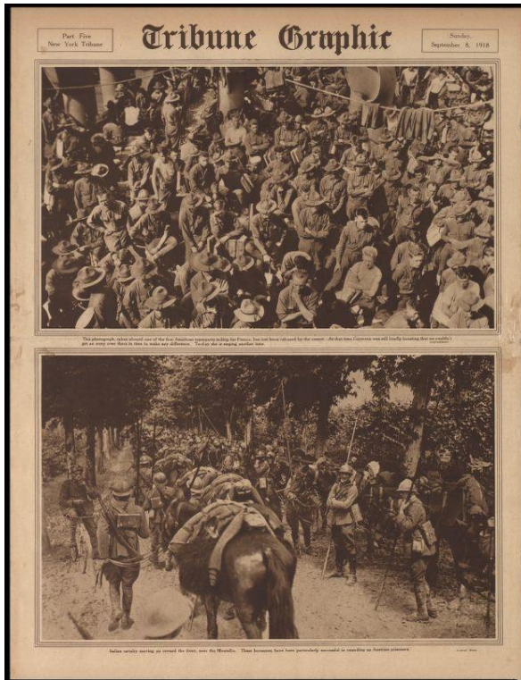
Figure 3. The New York Tribune . Sept. 8, 1918. Front Page of the New-York Tribune Graphic . Newspaper Image. New York, NY. Available online: https://www.loc.gov/resource/sn83030214/1918-09-08/ed-1/?sp=1&r=-0.316,0.085,1.436,0.832,0 (accessed on 27 September 2024).

The top photo depicts a crowd of American soldiers “aboard one of the first American transports sailing for France,” according to the caption. The anonymous faces of the men are framed at the top of the photo by the transport ship’s smokestacks—most likely made of steel. These men being hauled off to war were thus being transported by a ship and with weapons that were manufactured, at least in part, in the factories within which some of these men worked at home. These “ten million men [were] called to die” in the war, but the poem reminds readers that an entire steel industry at home helped prepare for the war, helped pave the way for the deaths of so many men with creative potential, so many men with “dreams of making things.” With the same meter and rhyme scheme as the first four lines, and with the same basic theme, the urgent and somber voice of “Fuel’s” second stanza dissonantly responds to the basic question, “Do ‘common men’ need art?” According to the politicians, the answer is “no.” Together, the first two stanzas of this poem create discordant, discomfiting, and complex responses by two separate voices musing over the same question, the same “call.”