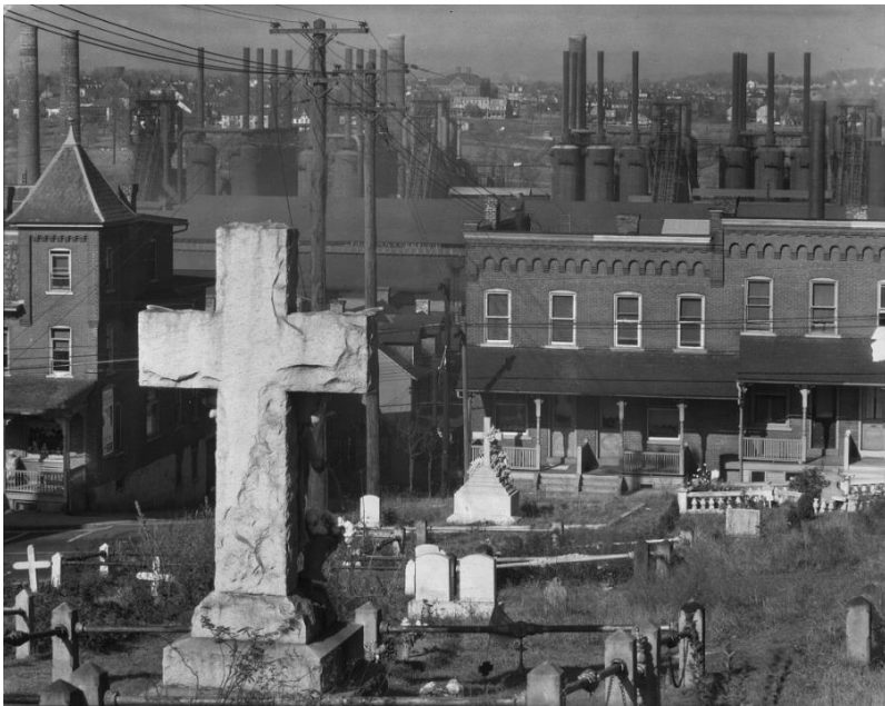
Figure 1. Evans, W. 1935. Bethlehem Graveyard and Steel Mill . Pennsylvania. Photograph. Library of Congress Prints and Photographs Division, LC-USF342- 001167-A [P&P] LOT 1329. https://www.loc.gov/pictures/resource/ppmsca.36750/ Witnessing views like this in the 1860s during wartime would have extended the meaning of the large white cross, a marker of death for mill worker and soldier alike.