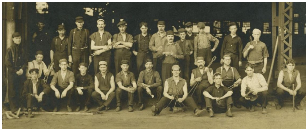
Figure 4. 1906. Rolling Mill Crew . Photograph. Pittsburgh, PA. Jones & Laughlin Steel Corporation Collection Photographs, 1864-1953, MSP 33, Library and Archives Division, Senator John Heinz History Center. MSP33.B005.F24.I02. Available online: https://historicpittsburgh.org/islandora/object/pitt%3AMSP33.B005.F24.I02 (accessed on 27 September 2024).