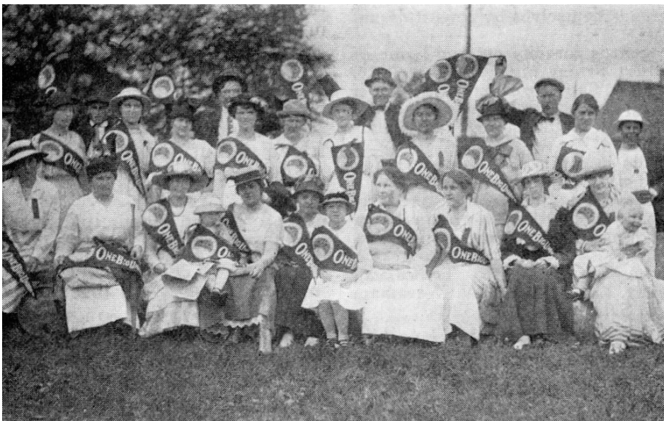
Figure 5. Dawson, George, Photographer. Aug. 1916. Just a Few Red Girls at the Finnish Picnic . Digital scan of photograph. The International Socialist Review 17.2: p. 78. Available online: https://www.marxists.org/history/usa/pubs/isr/v17n02-aug-1916-ISR-riaz-ocr.pdf (accessed on 27 September 2024).

It is also possible that Ridge had an image in mind from the August 1916 issue of the International Socialist Review (Figure 5), captioned as “Just a few red girls at the Finnish picnic”: