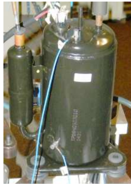
Fig. 2. Used compressor.

The second part of the methodology corresponds to the structuring of the work. In this part, the data acquired by DUARTE (2013) for the application of the statistical technique of multivariate analysis denominated discriminant analysis in the software of statistical analysis were used. The vibration acceleration signals were measured at two distinct points of the carcasses, with a sampling frequency of 33 333 Hz according to Fig. 2.