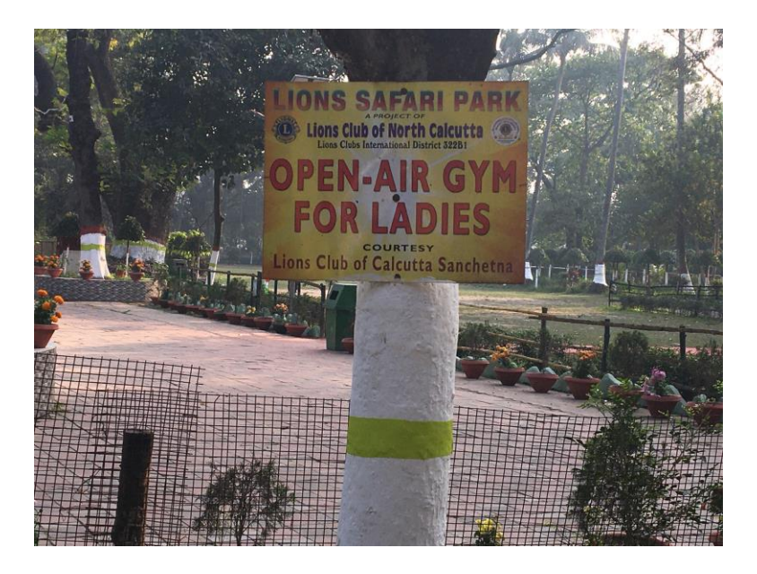
Figure 5: The idea of the gym is really taking off in India, as part of a global trend emphasizing personal responsibility for keeping the body fit.

successful aging ideologies were being taken up in India, shaped and inflected by local cultural and political contexts. So, I was indeed struck by all the talk of "active" and "healthy" aging around me in India, evident in everyday conversations, news media, the health sections of women's magazines, and new groups like Healthy Aging India. Kolkata's parks in the early mornings and late afternoons were filled with older people walking, some also meditating, practicing yoga, and congregating on benches with their mostly gender-segregated peers, sporting white sneakers or Nikes and Adidas running shoes, as signs of their active lifestyles. Several women told me proudly how they were able to take control of their health and prediabetes by walking two kilometers daily around their apartment complex's inner courtyard, or by taking a brisk morning walk around the whole village each dawn. Several emphasized, using the English term "active" even when speaking in Bengali, that good health in old age depends on staying "active," or that if you don't stay "active," your health will not be good. At the same time, when I would tell Kolkatans about my interest in older people and exercise, or that I had heard of a neighbourhood gym catering to seniors, several laughed and said, "I don't think working out for seniors is a very Bengali idea."