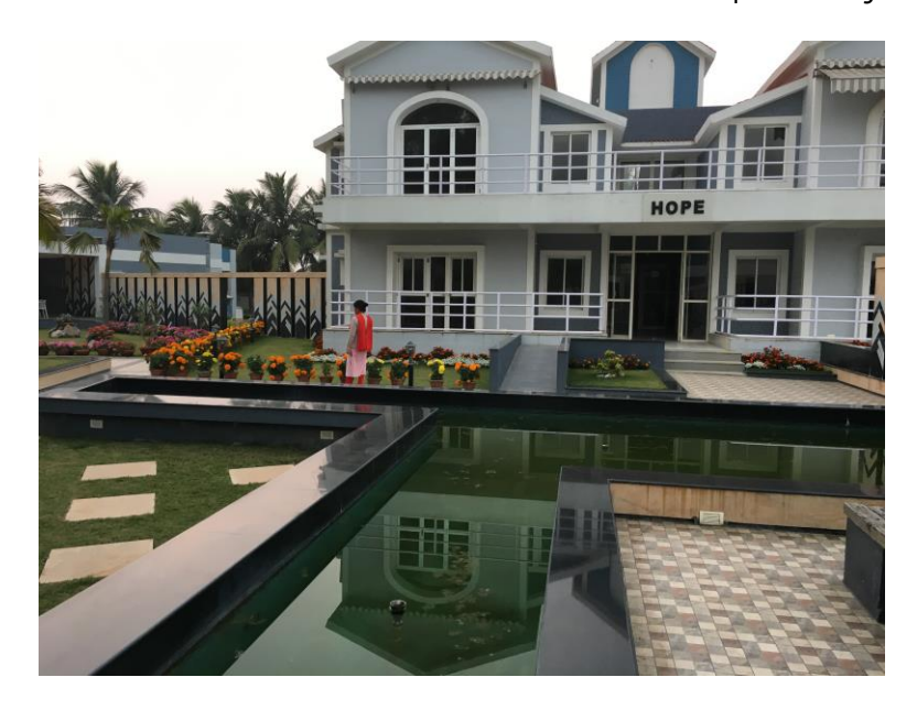
Figure 8: Aumorto's smallest apartment building, optimistically named Hope.