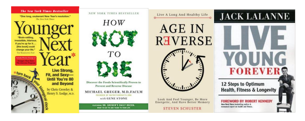
Figure 2: A selection of popular successful-healthy-anti-aging texts

The successful aging movement is also partly motivated by the needs of governments, I'd say. As the logic goes, if older people — who make up an increasing share of almost every nation's population — can stay fit, active, and productive, they will not become burdens to healthcare systems and economies. But what else is going on? I myself believe that the idea of successful aging is also connected to an extreme discomfort with oldness in North America. The prospect of being old-as in, you know, really old, different from your previous self, possibly frail, or needing care—is more shocking to a sense of self and more terrifying to many even than death. That's why it's impolite in US society to call someone 'old,' for instance, and embarrassing to need a cane or walker. This antipathy to oldness underlies the successful aging movement. You see bestselling books with titles like Live Young Forever, How Not to Die, Own Your Health: Healthy to 100, Age in Reverse, and Younger Next Year: Live Strong, Fit, and Sexy until You're 80 or Beyond.<sup>2</sup> I recall a line from one of these bestsellers: "Ailments and deteriorations are not a normal part of growing old. They are an outrage."3 These texts resonate with broader cultural aspirations to eradicate the human conditions of frailty, dependence, vulnerability, and illness that might otherwise be viewed as a normal part of a long human life course.