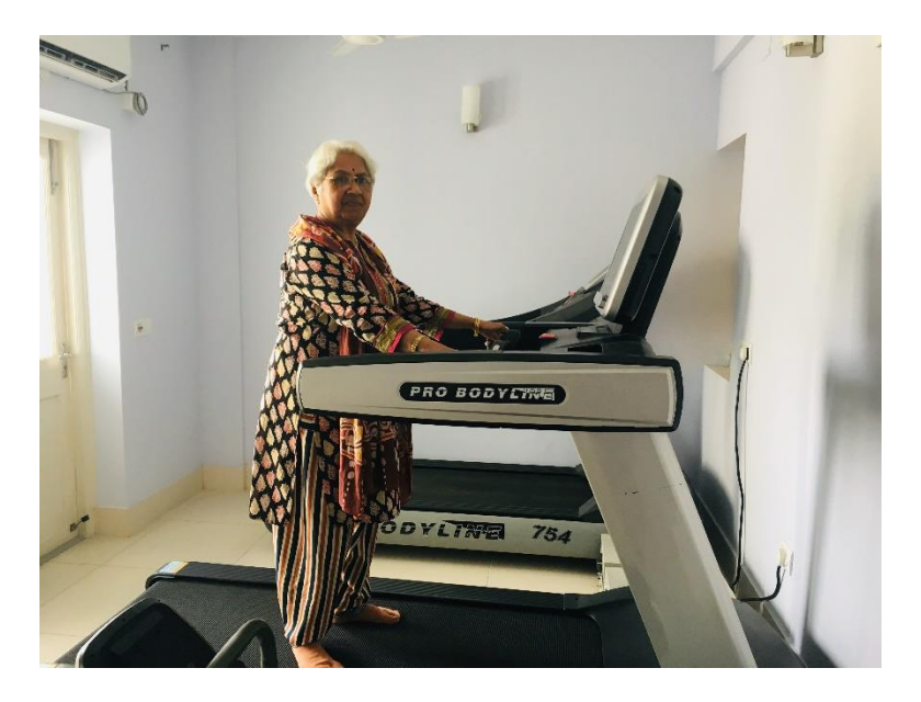
Figure 9: Posing on the treadmill.

the photo to her son. We walked out, and the staff re-locked the door. I should add that the 'swimming pool' I had heard of was not yet filled with water, and was shaped more like a lily pond than a medium for working out.