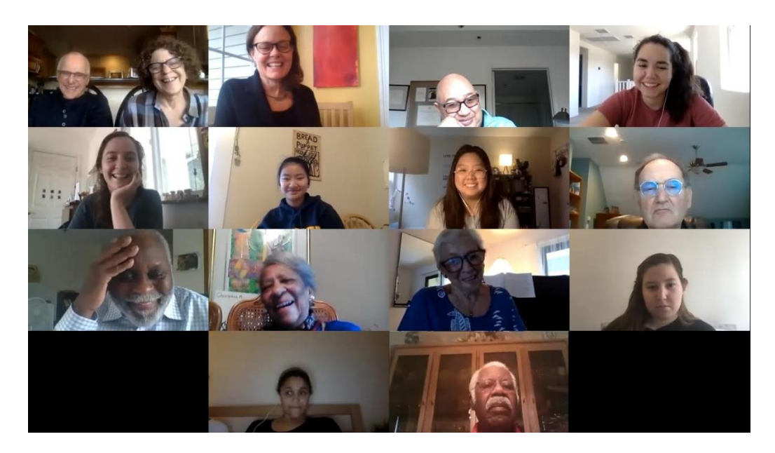
Figure 10: Zoom fieldwork in pandemic times

poor). They are of various race-ethnicities, including white and Black, and live mostly in Massachusetts and New York.