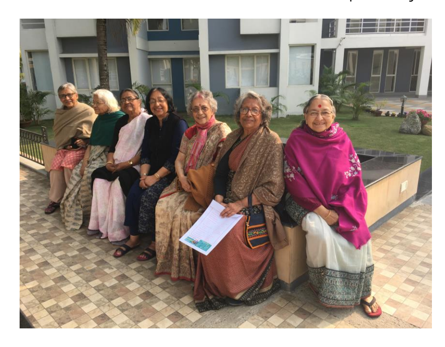
Figure 6: Lady retirement home residents: "We came here wilfully!"

Of note is that ordinary ideas about old age in India highlight that older persons are deserving recipients of care, and that they will need care—just as people in the US imagine that children will need care and are deserving of it. The ideal of the successful older person caring for themselves independently, as Elana Buch describes in Inequalities of Aging: Paradoxes of Independence in American Home Care (2018), does not hold the same kind of appeal in India as it does in the United States. In the Indian context, the oldage-home is taking on the resonance as an aspirational site of secure care, for older people who are appropriate and natural care recipients.