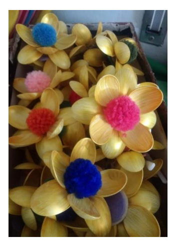
Photograph 8: Craft flowers made from plastic spoons. April, 2019.