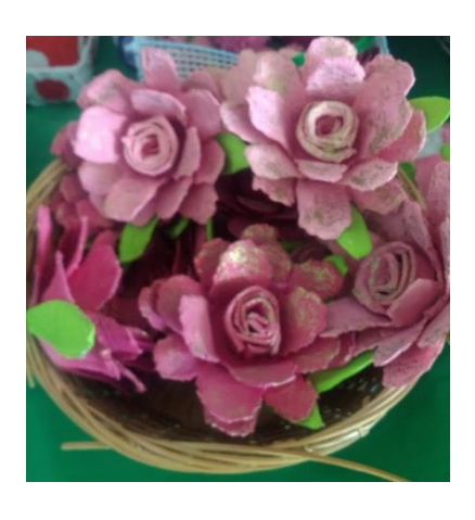
Photograph 9: Craft flowers made from egg boxes. Photograph taken by author. April, 2019.