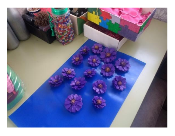
Photograph 10: Craft flowers from pine cones laid out for painting at the day centre. February, 2019.