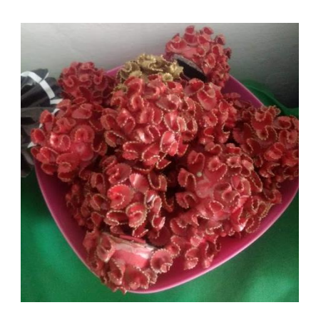
Photograph 7: Craft flowers made from pasta. April, 2019.