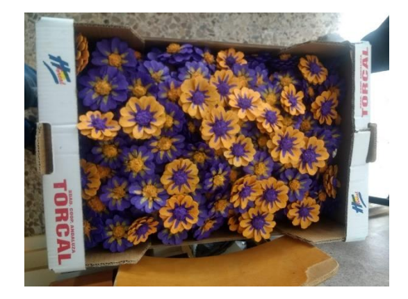
Photograph 11: Craft flowers made from pine cones in 2019. April, 2019.