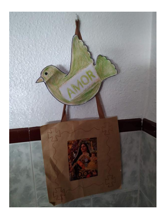
Photograph 4: A homemade decoration of the Virgin Mary on the wall in a care home bedroom. September, 2019.