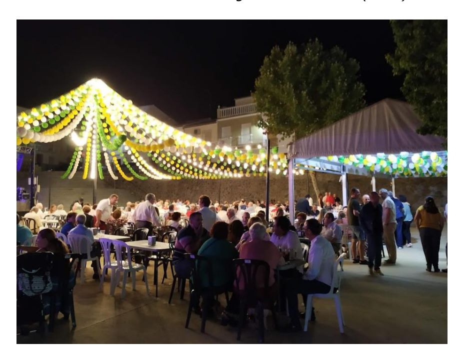
Photograph 2: Residents celebrate at the feria during fiestas. August, 2019.