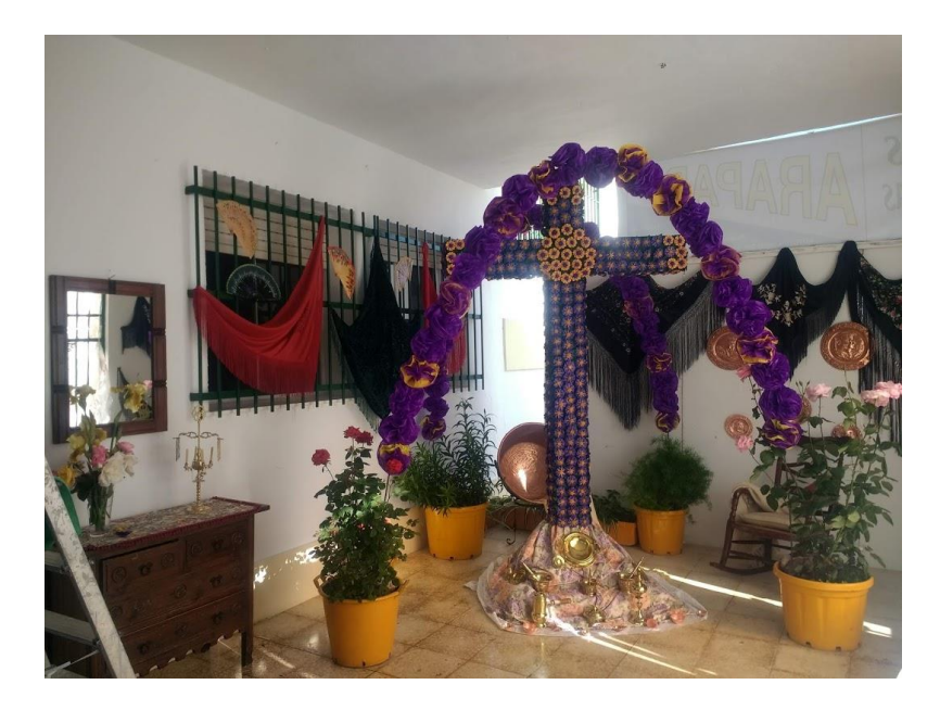
Photograph 13: The day centre's decorated cross on display with local artifacts during Fiesta de las Cruces. May, 2019.