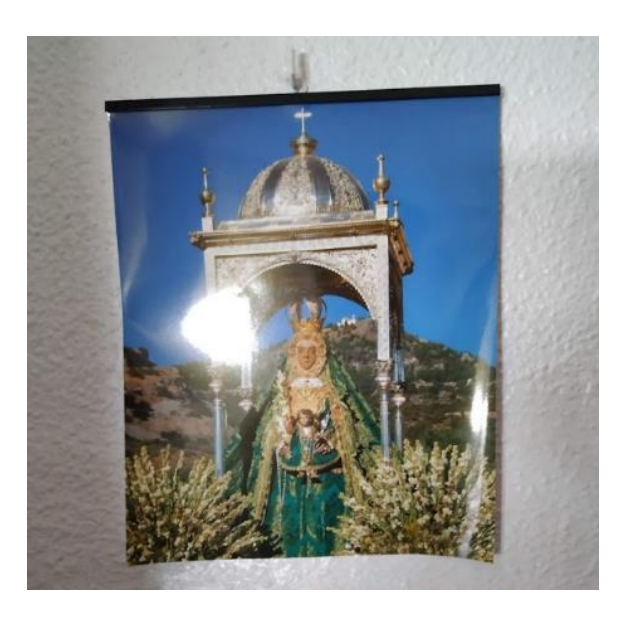
Photograph 6: Poster of Virgin Mary statue in front of Pueblo's landscape, on the bedroom wall of a care home. Photograph taken by author. September, 2019.

For abuelos , I observed how they seem to feel local spiritual protection from the Virgin saints more keenly and intimately when approaching the end of their lives. As I described earlier, bedroom walls in the care home are covered in images of these saints and Pueblo's landscape. The 'territory of grace' and spiritual protection offered by the saints, which is experienced through devotion towards the statues, appears to generate a sense of community belonging that could protect them from some of the health and social challenges they may face as they move into older age.