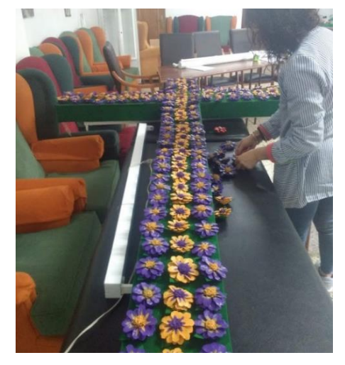
Photograph 12: Staff member preparing day centre's cross for Fiesta de las Cruces. April, 2019.