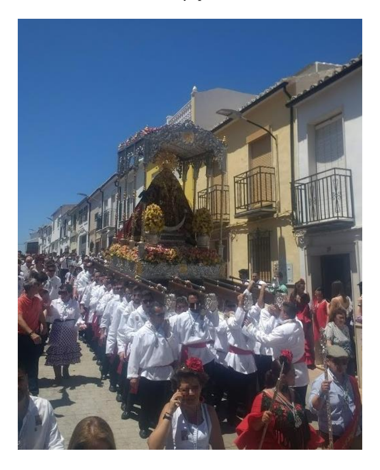
Photograph 1: Residents carry a Virgin Mary statue in a fiesta procession (N.B. faces blurred to protect anonymity). May, 2019.

with anthropologists investigating ageing by arguing that community religious rituals have the capacity to generate a spiritually and collectively therapeutic role in eldercare. This demonstrates the importance of approaching elder and dementia care as not only 'person-centred' but also as 'community-centred.'