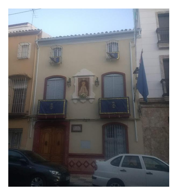
Photograph 14: Icon of Virgin saint set into a house in Pueblo. May, 2019.

felt a closer alliance, devotion, and sense of belonging to their neighbourhood statues because these objects were closely tied to their home and everyday life.