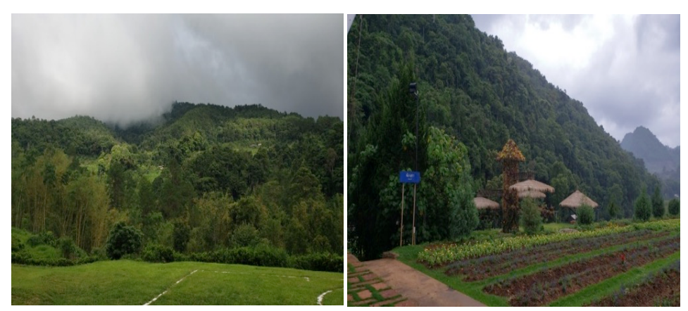
Note. Images captured during fieldwork in 2019.

Images of Doi Angkhan captured in June 2019, Depicting the Transformation of Northern Thailand as a Result of Investments to Human Capital Made through the SEP