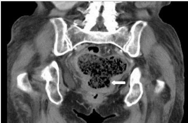
Figure 1: Coronal view of patient's abdominopelvic computed tomography.

Received: April 2015; Accepted: June 2015