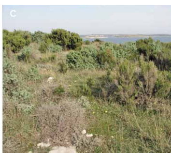
Fig. 2. Habitus (A), sporangia (B) and habitat of Ophioglossum lusitanicum L. on Kamenjak (C).

It is noteworthy that habitats of Cape Kamenjak, one of the richest localities of least adder's-tongue in Croatia, are regularly disturbed by grazing, tourist visits and even military exercises (performed yearly in autumn). A recent study on the effect of trampling on some rare species on the French island Quessant has revealed that O. lusitanicum favours low-medium intensity of trampling (Kerbiriou et al. 2008). It has been found that for successful germination, spores of O. lusitanicum require variable periods of darkness (Whittier 1981). Therefore, pushing the spores deeper into the soil by trampling could account for the beneficial effects of this type of disturbance on this species.