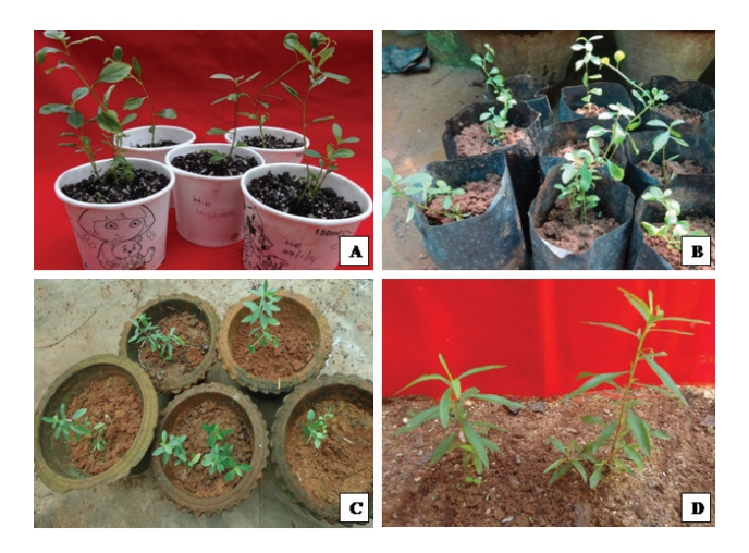
Fig. 2. Hardening of Hybanthus enneaspermus plantlets in the greenhouse (A-C), and in vitro raised plantlets under field conditions (D).

Tab. 4. Effect of auxins indole-3 acetic acid (IAA), indole-3 butyric acid (IBA), \alpha -naphthalene acid acid (NAA), and naphthoxy acetic acid (NOA) on ex vitro root induction from in vitro raised shoots. Significant variation between the concentrations was studied using Duncan's multiple range test at 0.5% level, SD – standard deviation.