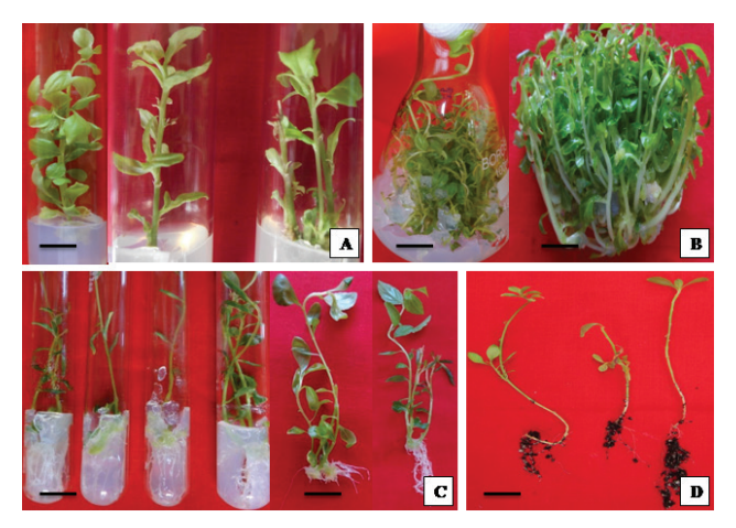
Fig. 1. Micropropagation of Hybanthus enneaspermus : induction of shoots from the nodal segments with 6-benzylaminopurine (A); multiplication of shoots on MS medium (B); in vitro rooting of the excised shoots on MS medium with indole-3 butyric acid (C); ex vitro rooted plantlets (D), scale bars = 2 cm.

The fresh and light green colored nodal segments responded better than old and dark colored explants. Cultures were initially placed in diffused light (20–25 \mu mol m<sup>-2</sup> s<sup>-1</sup>) to induce bud breaking, and further transferred to a culture room with a higher light intensity (40–50 \mu mol m<sup>-2</sup> s<sup>-1</sup>) for proper establishment of culture. The MS medium supplemented with 1.5 mg L<sup>-1</sup> BAP was observed suitable for bud breaking and 97% of the explants responded with 6.4±0.69 shoots from each nodal explants (Fig. 1A, Tab. 1). Maximum