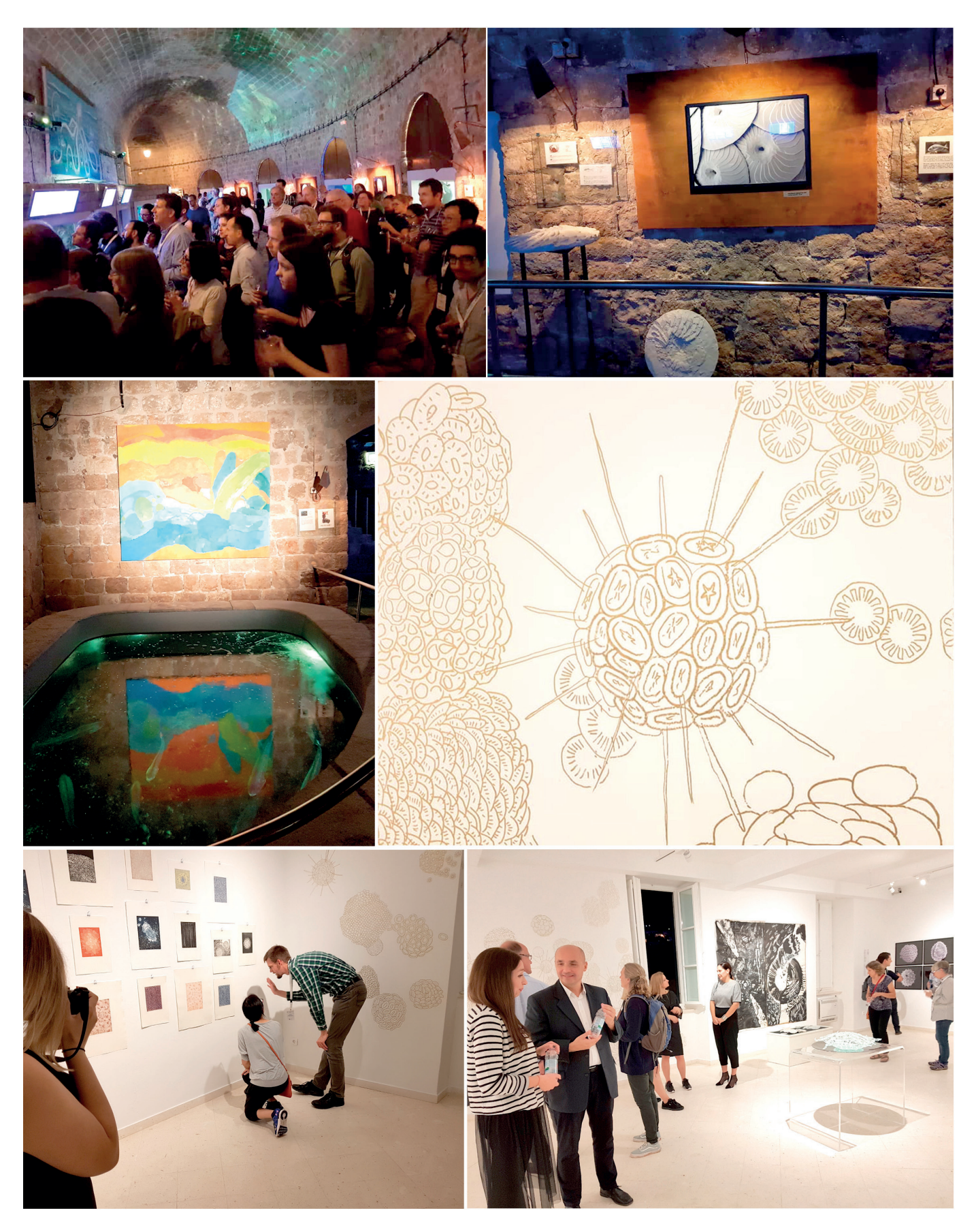
Pl. 2. Opening of the exhibition "The Beauty in Detail, Transformation and Structure – Adriatic Coccolithophores" in Natural History Museum in Dubrovnik and the Aquarium of the Institute of Marine and Coastal Research (University of Dubrovnik), October, 2018. (Photos: Nenad Jasprica, Danko Friščić, Anamarija Lesica).