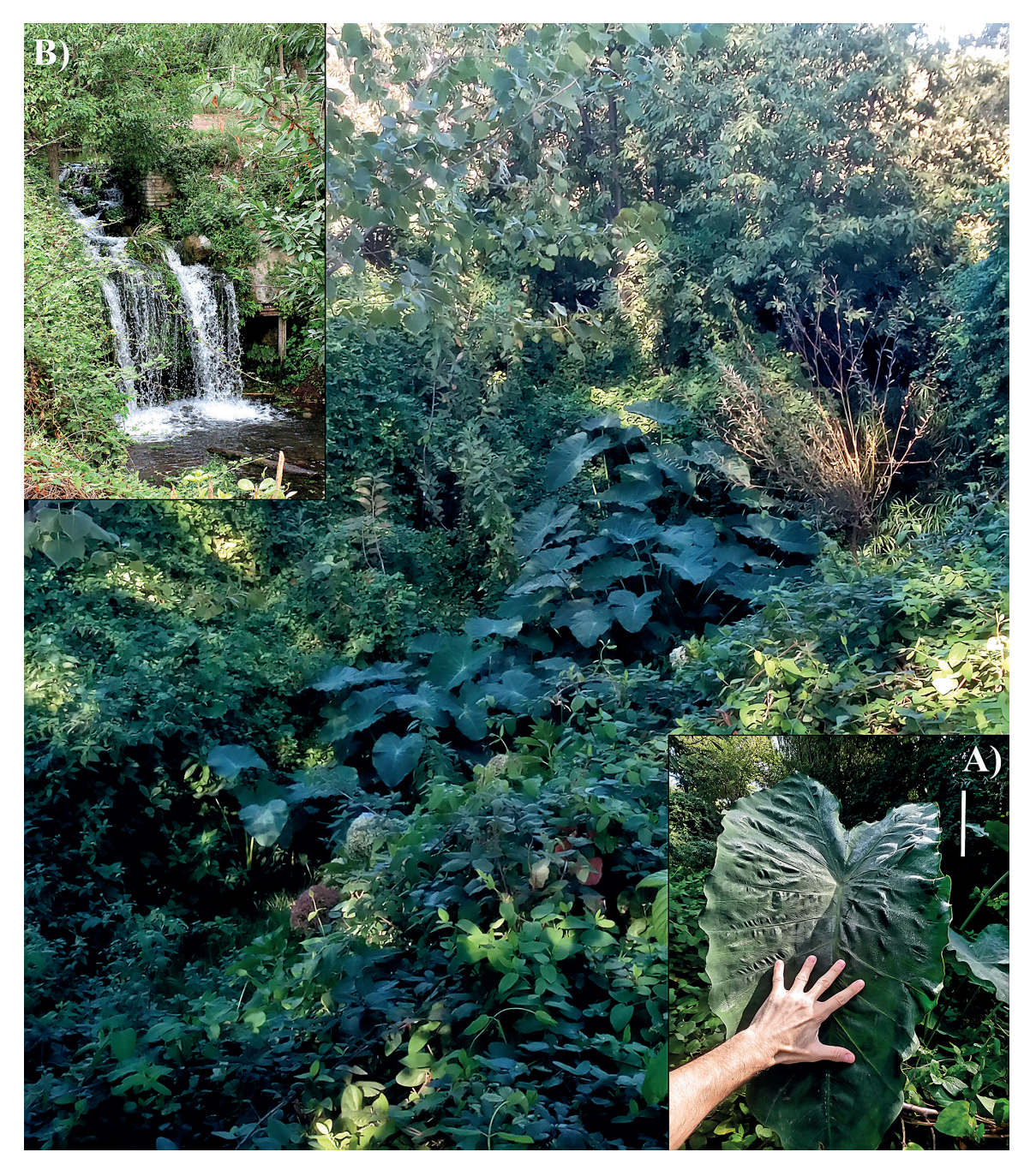
Fig. 1. Colcasia esculenta (L.) Schott in Lazio, central Italy: main population; A) detail of a leaf (scale bar = 10 cm); B) population located near the waterfall (photo by D. Iamonico, 18<sup>th</sup> October 2020).

Perennial rhizomatous (geophyte/helophyte), 1.5–2.5 m tall. Rhizome horizontal, 5–6 cm in diameter (Fig. 1). Sto-