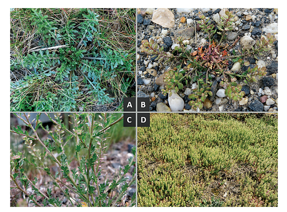
Fig 3. Habitus (A – C) and habitat (D) of Lepidium oblongum in Hungary. A – Csorna, March 26<sup>th</sup>, 2021, B-C – Jánosháza, April 27<sup>th</sup> 2020, D – Jánosháza, April 23<sup>rd</sup>, 2020.

Observations at various railway buildings and around the railway track prove that its appearance in Hungary is undoubtedly related to railway transport. These areas of the railway track are the track sections most affected by the