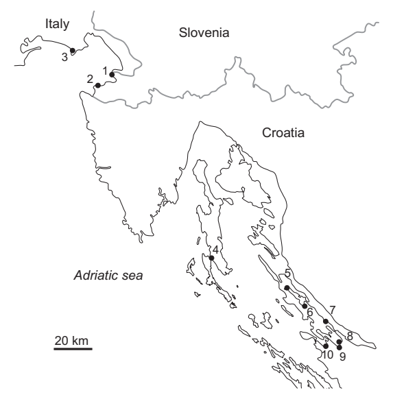
Fig. 1. Plants originating from Italian (3), Slovenian (1, 2), and Croatian (5–10) Salicornia populations.