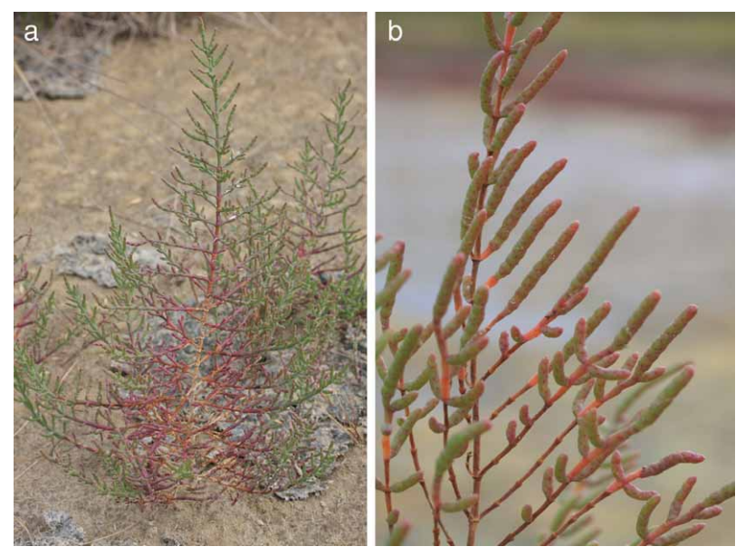
Fig. 3. Plant architecture of Salicornia patula (a) and Salicornia emerici (b).

in saline conditions (Fig. 2c). In each species the germination rate was inhibited and the germination of lateral seeds was especially slowed down with salinity.