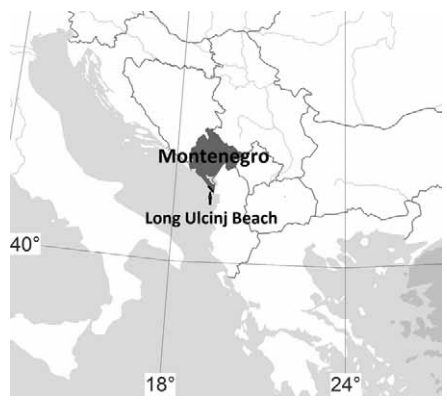
Fig. 2. Geographical position of Long Ulcinj Beach (basic map: afe_basemap, with permission of the Atlas Florae Europaea).

At approximately 12 km, Long Ulcinj Beach is the longest beach on the Adriatic coast, at the south-eastern end of which it is located (Fig. 2). This area is bordered by the channel of Port Milena to the west and the Bojana River to the east. It belongs to the wide Ulcinj plain, frequently exposed to very strong winds that carry sand from the shore inland, so sand covers a major part of the area (MIJOVIĆ 1994).