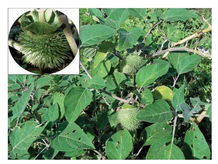
Fig. 4. Datura innoxia, habitus and fruits.

ity several alien species were present: Phytolacca americana L., Chenopodium multifidum L., Datura stramonium , Conyza albida Spreng. and Conyza canadensis (L.) Cronquist. Monitoring of this population since May 2010 to November 2012 did not show any significant invasion into the surrounding hinterland. This year another population of Datura innoxia was found in Dobre Vode, 25 km away from the first locality.