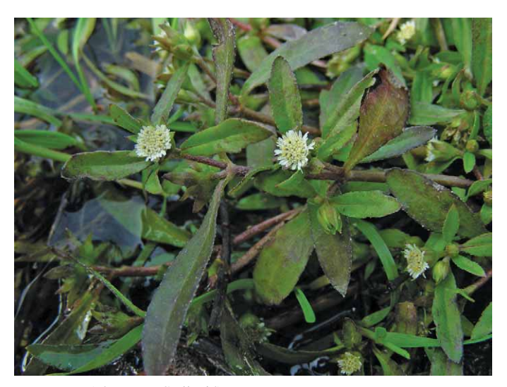
Fig. 5. Eclipta prostrata.

Eclipta is a small genus in the family Compositae (tribe Heliantheae), of which several species are distributed primarily in the New World and some in the Old World (UMEMOTO