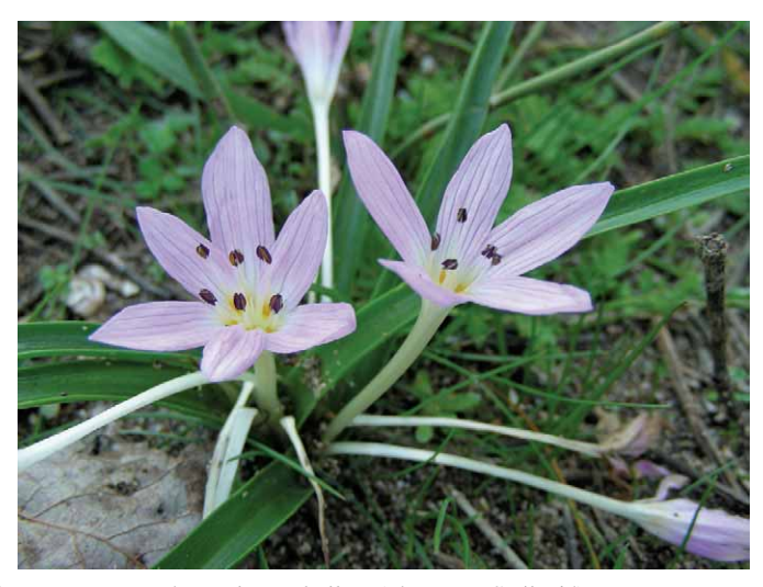
Fig. 3. Colchicum cupanii subsp. glossophyllum.

On Long Ulcinj Beach C. cupanii subsp. glossophyllum was recorded in three localities, placed in the belt transect of 1.5 km. In each case the substrate was sandy, but the habitat type differed. In the first locality (N 41° 54' 33", E 19° 15' 23.3"), four individuals of Colchicum were present. The habitat was identified as NATURA 2000 – 2270 Wooded dunes with Pinus pinea and/or Pinus pinaster . In the tree layer the dominant species were Pinus halepensis Miller. and Pinus pinaster Aiton, while in the shrub and herb layer the following species were common: Quercus coccifera L., Myrtus comminus L., Smilax aspera