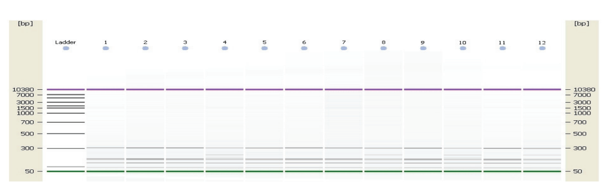
Fig. 2. Effects of mycorrhizal inoculation and nutrient supply on RFLP profiles of amplified fragment with primer pairs of 27f and 534r after digestion with endonucleases Hin6I (HinP1I) and BsuRI (HaeIII)

L: Ladder, Line 1-4 regarding after six weeks of growth: 1: AM1-OSM+; 2: AM1-OSM-; 3: AM1+OSM+; 4: AM1+OSM-; Line 5-12 regarding after 12 weeks of growth: 5: AM1-OSM+; 6: AM1-OSM-; 7: AM1+OSM+; 8: AM1+OSM-; 9: AM1-OSM+AM2+; 10: AM1+OSM-AM2+; 11: AM1+OSM+AM2+; 12: AM1-OSM-AM2+