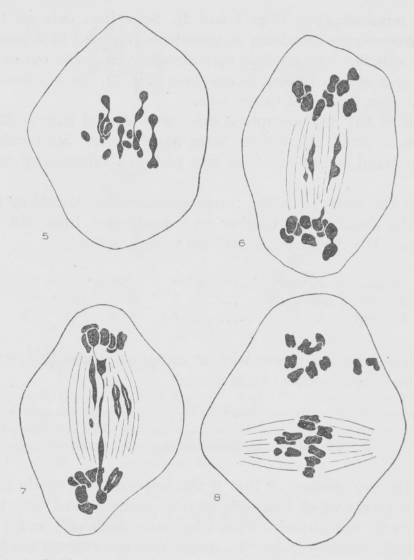
Figs 5-8. PMC of the hybrid R u b u s saxatilis \times arcticus. — Fig. 5. First metaphase side view. 3 trivalents 3 bivalents and 6 univalents. — Fig. 6. First anaphase. Lagging trivalents and a fragment. — Fig. 7. First anaphase. Inversion bridge with a fragment and two lagging bivalents. — Fig. 8. Second metaphase. Different chromosome numbers in the plates. Two eliminated chromosomes. — \times 3200.

If we compare these values with those obtained from the autotriploid R.idaeus (18, p. 144) it is seen that the number of bivalents and univalents in the present hybrid is clearly greater, the number of trivalents correspondingly smaller. This shows that the hybrid complement is not comparable with the autotriploid.