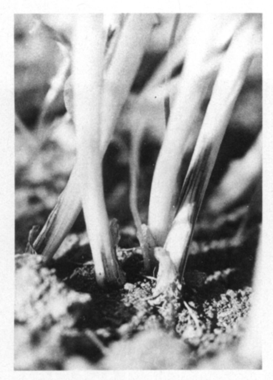
Fig. 2. Foot rot symptoms at the time of heading.