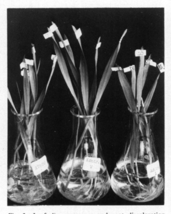
Fig. 3. Leaf dip senescence and root discoloration caused by toxic metabolites of Bipolaris sorokiniana.

tionally dry conditions (Fig. 2). Barley cultivars, which were found susceptible in pot experiments were also susceptible in the field but no data is presented because of the uneven distribution of the fungus in the field soil.