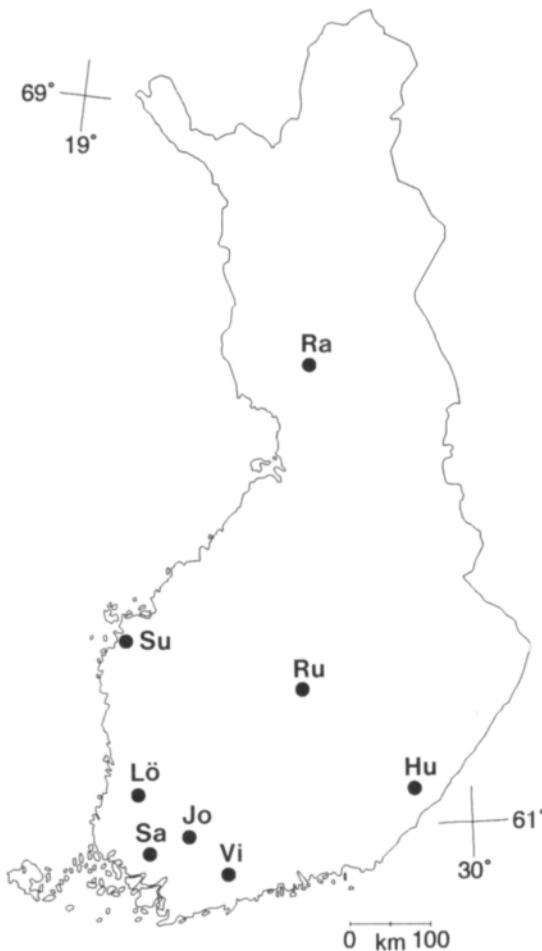
Fig. 1. Location of the 8 stations with continuous rainfall measurements analyzed in this paper.

Continuous rainfall records from 8 stations (Fig. 1) were analyzed in this study for estimating the para-