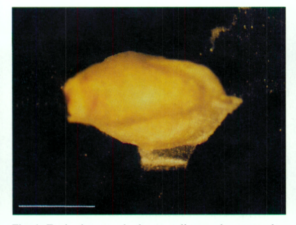
Fig. 1. Excised mature barley scutellum-embryo complex after 24 hours of imbibition in distilled, sterilized water. Scale bar = 1 mm.