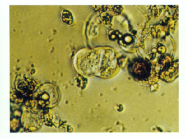
Fig. 3. Cell divisions in barley protoplasts.