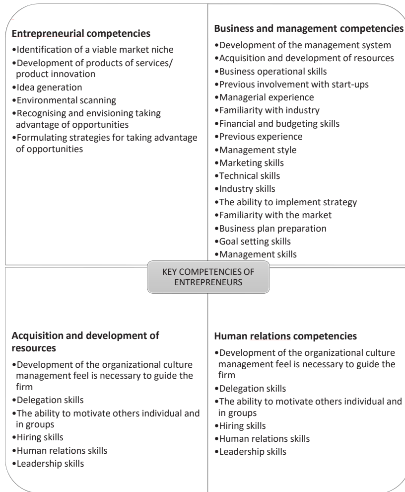
Fig. 1. A summary of key competencies (Mitchelmore and Rowley 2010)

As entrepreneurial competencies are found to be a distinct set of competencies that are highly relevant to entrepreneurship (Mitchelmore and Rowley 2010), we develop the entrepreneurial BM innovation competency framework for the purposes of our empirical analysis in the context of horticulture industry renewal by focusing especially on the entrepreneurial competencies identified in Mitchelmore and Rowley’s framework (Fig. 2).