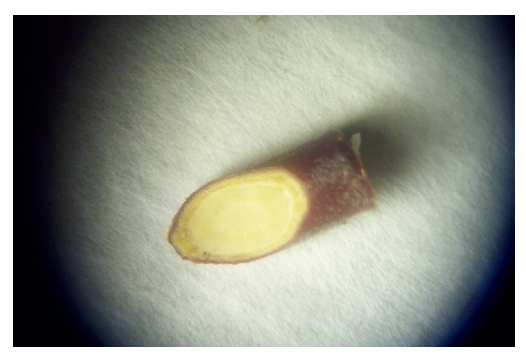
Fig. 1. Low tissue damage seen as a slight darkening in annual branch of 'Sandra' at -40 °C (damage points: bark - 1.3, cambium - 1.0, wood - 1.0) (II Component)

In terms of wood stability, the studied cultivars did not differ significantly from the controlled cultivars. 'Make', 'Samo' and 'Sandra' were identified as the most stable cultivars (Fig. 1), the tissues of which had small reversible damage.