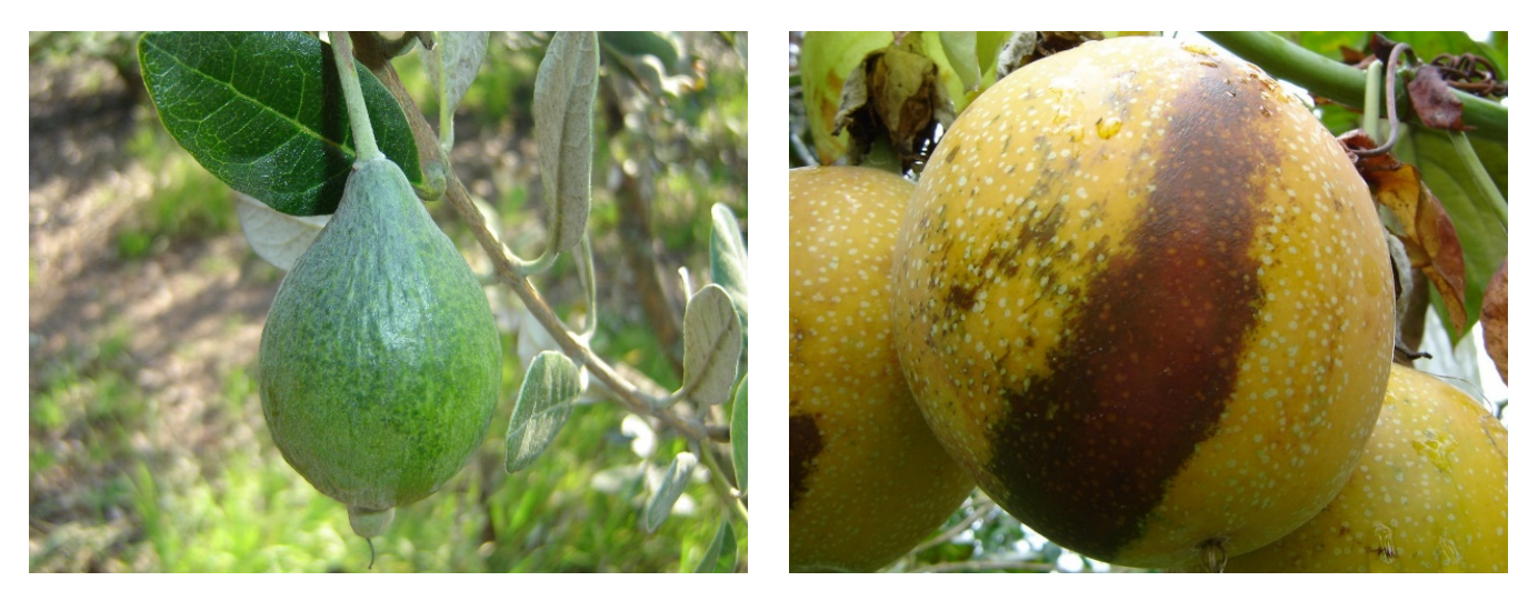
FIGURE 3. A) Chilling injury in feijoa (Acca sellowiana) and B) sunburn in sweet granadilla (Passiflora ligularis) in Colombian highlands.

causing an accelerated loss of moisture and increasing susceptibility to fruit cracking (Ikram et al. , 2020; Fischer, Balaguera-López & Álvarez-Herrera, 2021). For example, in the case of Japanese plums ( Prunus salicina ), excessive radiation manifests itself as a brown to yellow discoloration on the surface of the fruits, which, in severe cases, can result in necrotic spots and cracking of the fruit epidermis (Makeredza et al. , 2018).