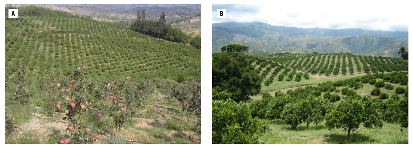
FIGURE 1. Apple orchards in the A) Boyacá highlands and B) citrus fields in the Valle department of Colombia.

passion fruit in the Department of Huila (Colombia) grown at 2,060 and 2,270 m a.s.l., the predawn values of the maximum photochemical efficiency of photosystem II (Fv/Fm > 0.86) confirmed that the plants were not exposed to stress conditions and the two altitudes are suitable for the cultivation of passion fruit in this region (Fernández et al. , 2014). Fruit cultivars outside their optimal altitude range do not generate economic profitability, and plants at a higher altitude grow too slowly, with lower yields and qualities. At too low altitudes, they grow too fast, without developing their typical and stable post-harvest quality (Fischer & Parra-Coronado, 2020).