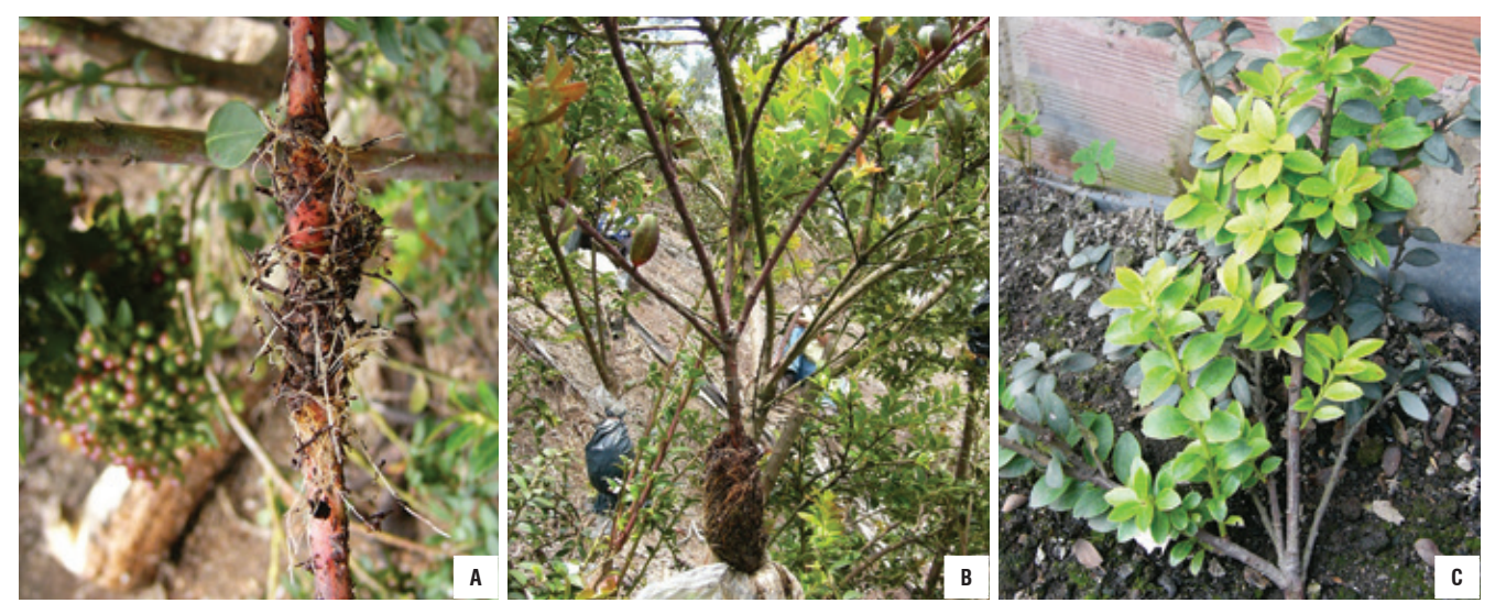
FIGURE 3. A. Callus formation and early roots. B. Development of roots. C. Eight-month-old plant, originating from layering and transplanted to a final site.