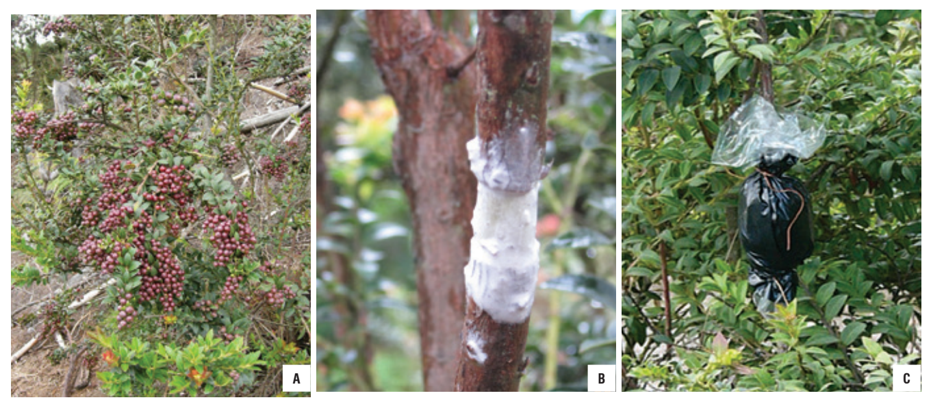
FIGURE 1. A. Selection of the mother plant. B. Ring and rooting promoter application. C. Layering cover.