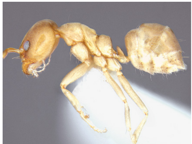
FIGURE 3. Linepithema angulatum (Mayr, 1870) adult. The specific name refers to the distinctive angulate propodeum.

Discussion of the L. angulatum identity. According to Wild (2007), some worker specimens from Central America are difficult to identify at the species level as they occasionally have a small pair of subdecumbent setae on the frons.