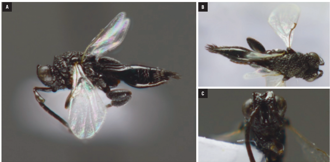
FIGURE 4. Specimen of the Ecuada producta from the CTC of the UNAB entomological museum: A) lateral view, B) dorsal view, C) frontal view.