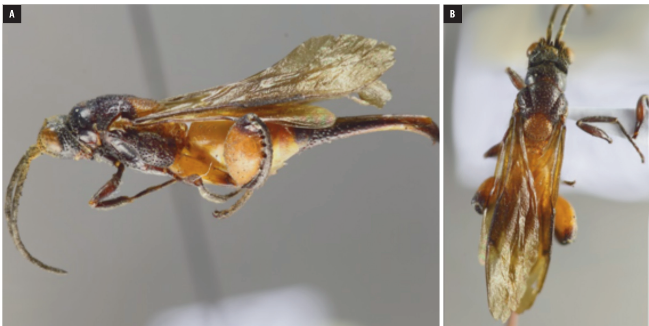
FIGURE 3. Specimen of the genus Parastypiura from the CTC of the UNAB entomological museum: A) lateral view, B) dorsal view.

Comment by the authors: this is the first record of the genus for Colombia.