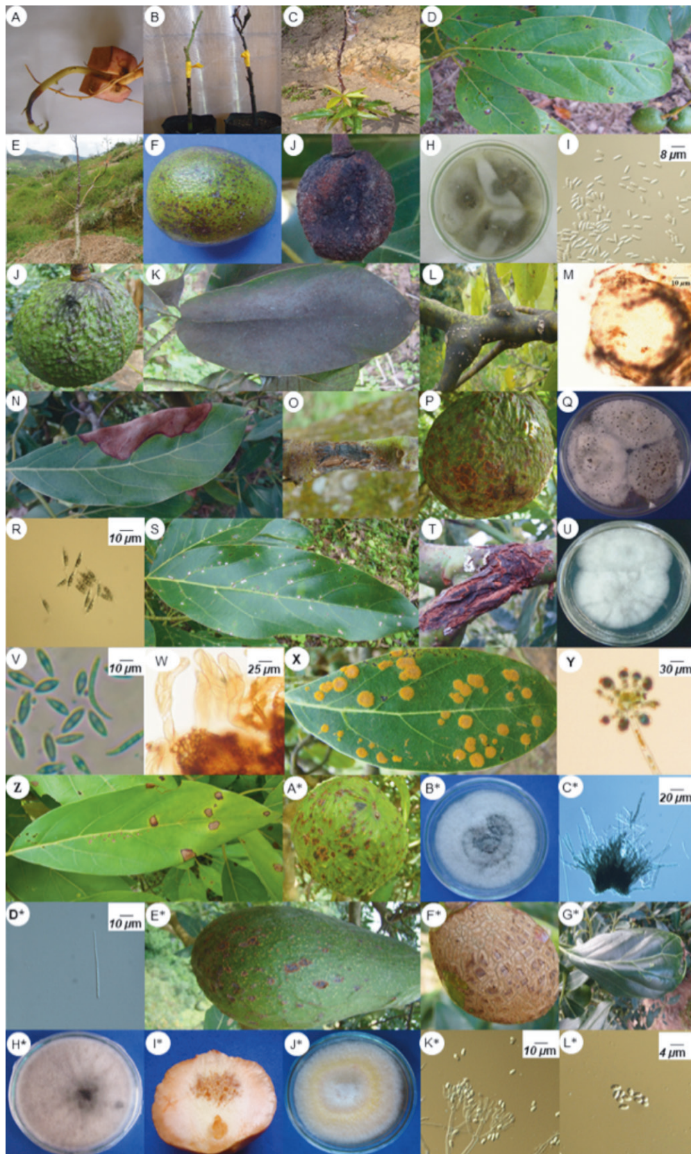
FIGURE 3. Symptomatology and structures of microorganisms associated to causal agents of pre-harvest diseases on avocado cv. Hass. A to I: Colletotrichum gloeosporioides sensu lato . J to M: Capnodium sp. N to R: Pestalotia sp. S to W: Phomopsis sp. (teleomorph Botryosphaeria sp.). X and Y: Cephaluros virescens . Z* to D*: Pseudocercospora purpurea . E* to H*: Sphaceloma perseae . I* to L*: Penicillium sp.