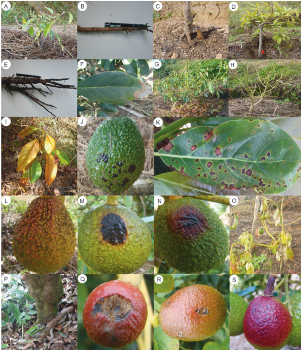
FIGURE 2. Symptomatology associated with abiotic disorders of pre-harvest diseases in avocado cv. Hass. A to E: Root atrophy. F to H: Hypoxia-anoxia. I to K: Herbicide phytotoxicity. L to N: sunburn. O and P: rootstock-scion incompatibility. Q and R: hail stone damage. S: Peduncle ringing.