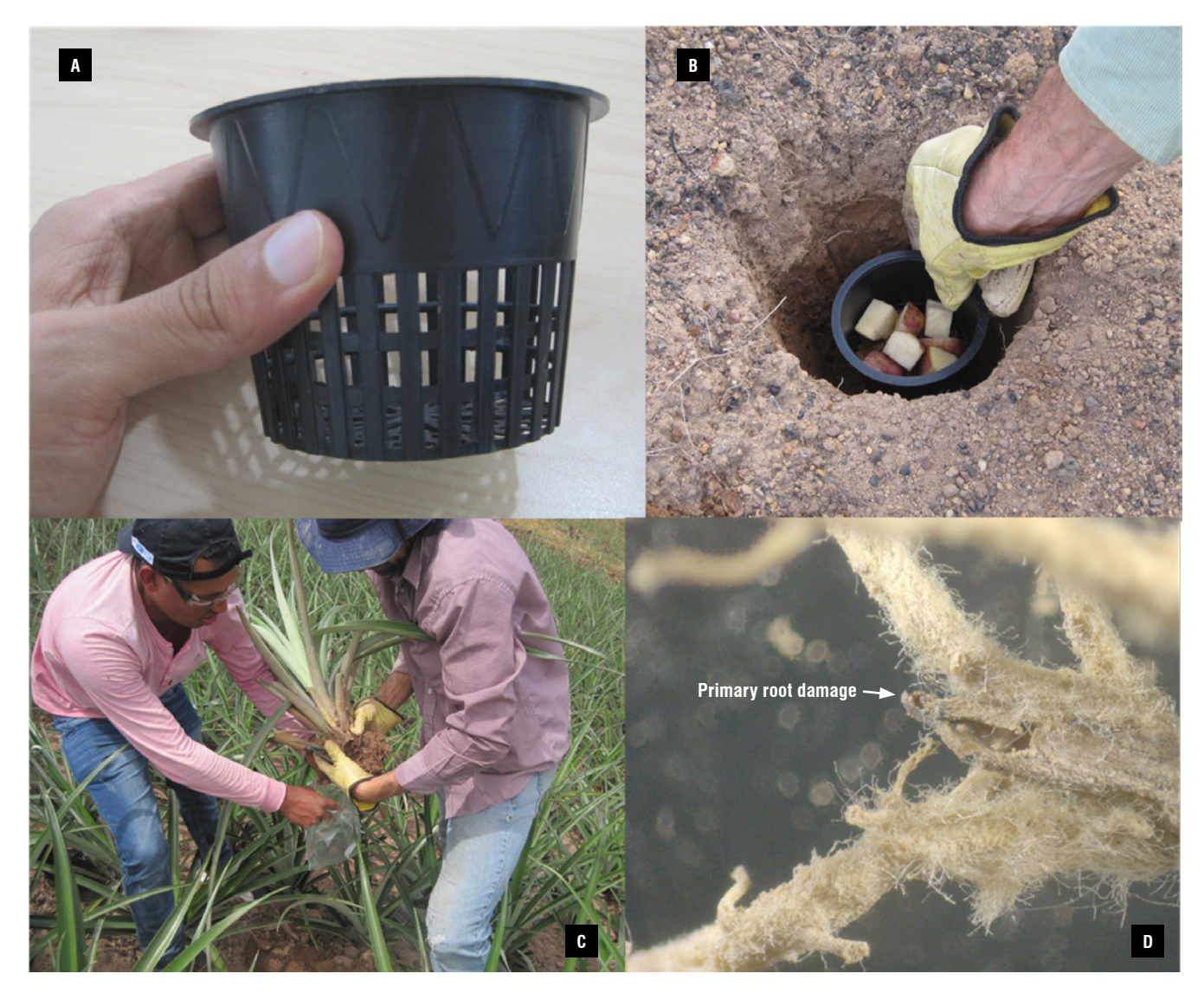
FIGURE 1. Symphylid sampling methodology. A) PVC plastic container used for sampling. B) Container with 50 grams of potato used as bait. C) Collection of plants. D) Bifurcation in the roots caused by symphylid damage.

The traps were transferred to the laboratory of La Suiza Research Center of the Colombian Agricultural Research Corporation - AGROSAVIA. There, they were thoroughly checked, spreading the soil and the bait in a dark-colored plastic tray where the captured specimens were collected with brushes and deposited in 75% ethyl alcohol.