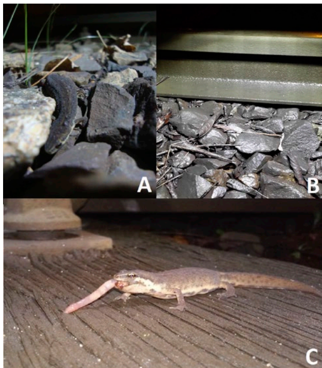
Fig. 2. (A) Male Smooth newt L. vulgaris during the searching for prey among crushed stone aggregate; (B) crushed stone aggregate as newts habitat with the rail in the background; (C) female Smooth newt found feeding on earthworm on the surface of a wooden sleeper (October, 2014).